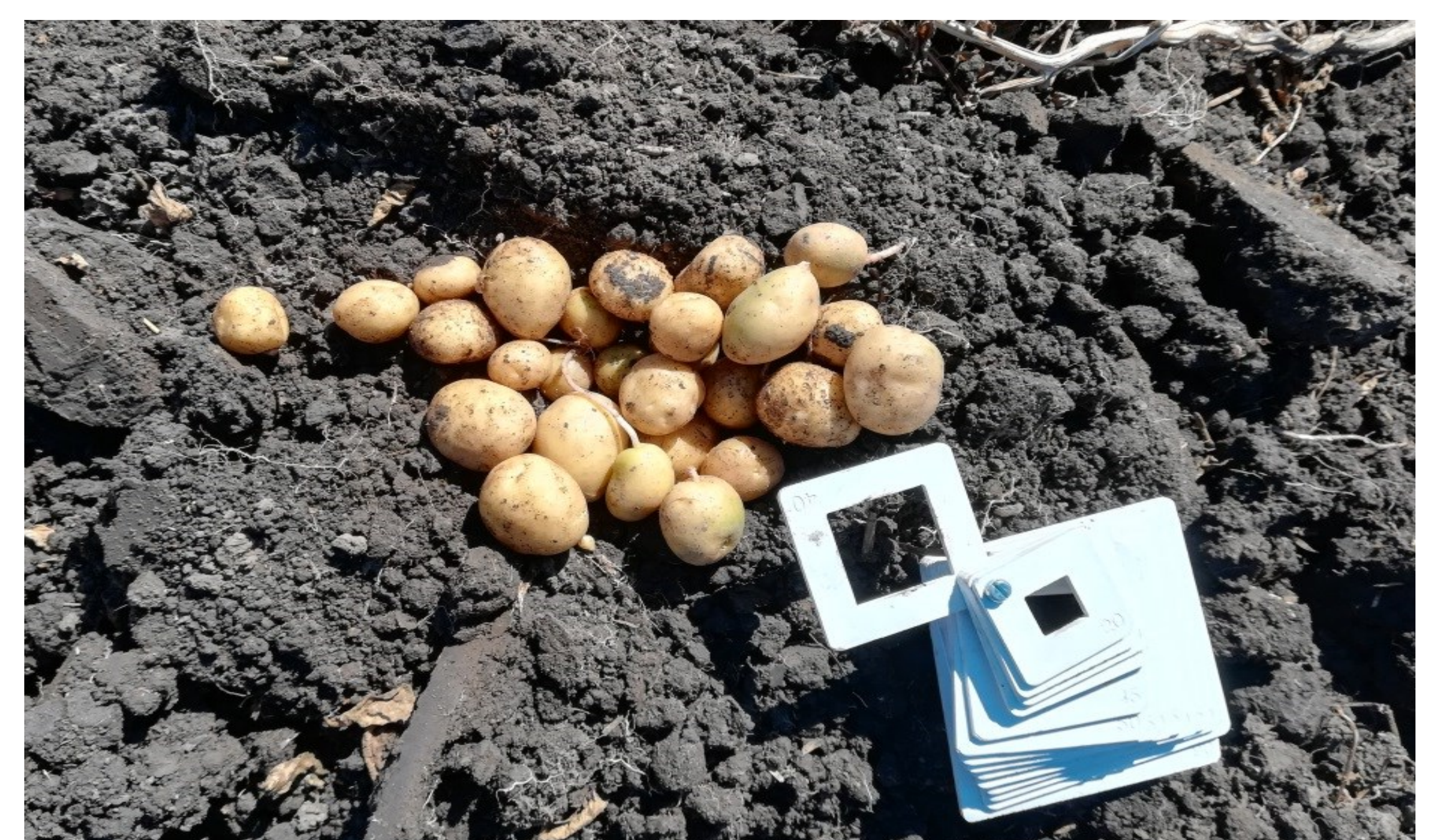
Mean Total Field Yield and Postharvest Percentage Loss - irrigated and non-irrigated fields 2018