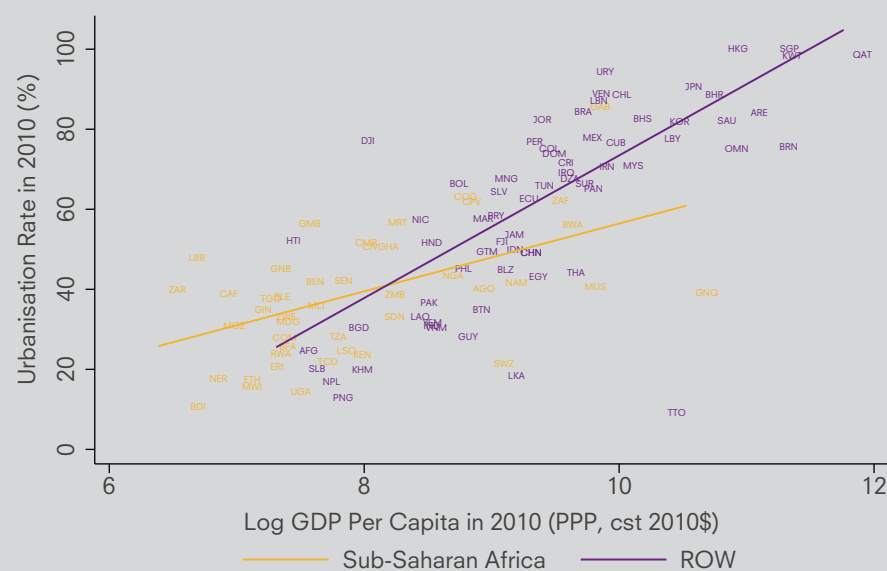
Figure 1: Relationship between the urbanisation rate (%) in 2010 and log GDP per capita (PPP, constant 2010$) for a sample of 116 countries

Note: Sub-Sahara Africa (N = 46), Asia (27), Latin American and the Caribbean (26) and Middle-East and North Africa (17). The graph splits the sample into Sub-Saharan African countries and all others in the sample from the rest of the world