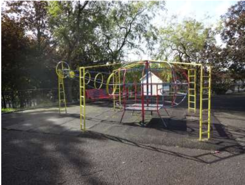
Figure 6: Playground at Moss Heights high flats, Glasgow, April 2016

In the 1990s and early 2000s we see echoes of the past and repeated shortcomings. While the planning of services and amenities moved into the realm of partnerships between public, quasi-public and third sector organisations, and community involvement was seen as central, communication was with adult representatives rather than children, despite international developments in children's rights and participation at this time. 70 The events-led approach to city wide regeneration also continued with the development of a city marketing bureau in 2004 to attract tourists, conferences and sports meetings to the city. 71 In this regard, selling Glasgow's image as the 'Dear Green Place' was important so that the upkeep and development of the city's main parks was perhaps the priority rather than caring for, or making, additional local provision for outdoor play. Access to such parks and open spaces was also very uneven and dependent on the ability to travel as determined by financial resources and the age of the child.