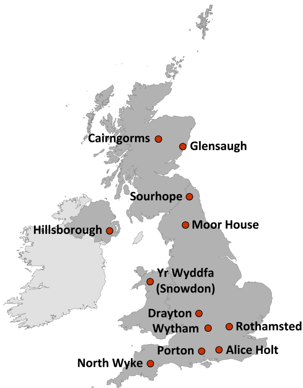
Figure 1. Locations of the ECN terrestrial sites.

load. The protocols are designed to ensure consistency in methods and data handling over time and across the ECN's sites. Sites were visited on the same day each week, preferably on a Wednesday, to synchronise sampling, within the site and across the network.