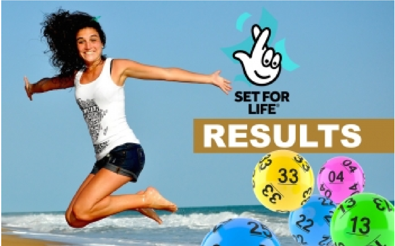
Set For Life Results Thursday 19th December 2019