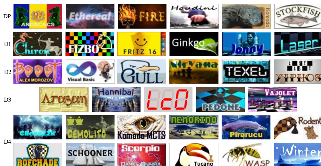
Fig. 1. Logos for the TCEC 14 engines (CPW, 2019) as in their original divisions.

The trio of STOCKFISH, KOMODO and HOUDINI have dominated the TCEC medals for several seasons and a key point of interest was whether others would reach the podium. LEELA CHESS ZERO and ETHEREAL were certainly expected to perform well in Division P, having shown remarkable improvement in the previous few months. KOMODO MCTS was a dark horse.