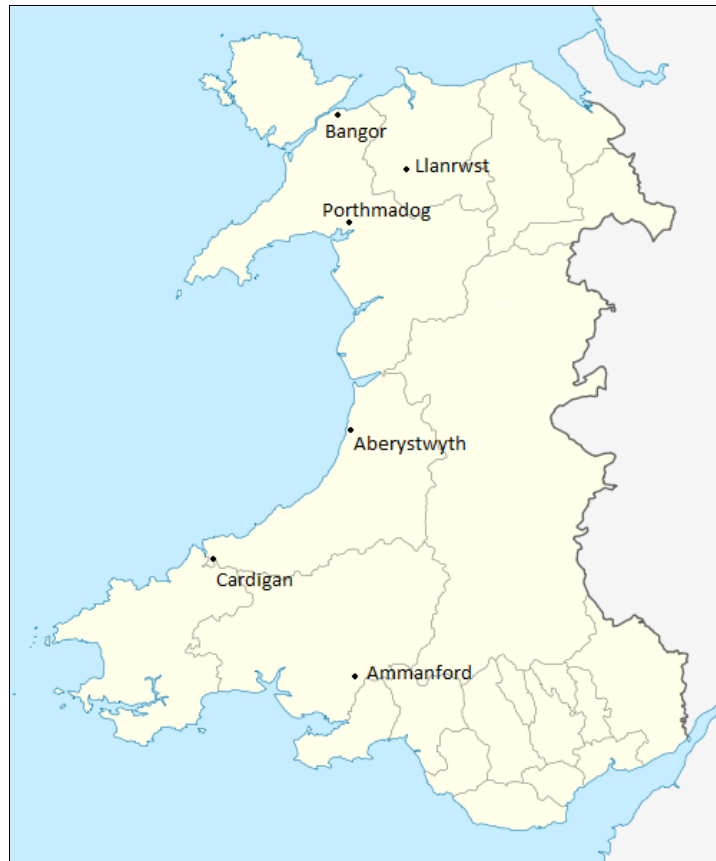
Figure 1: Location of communities