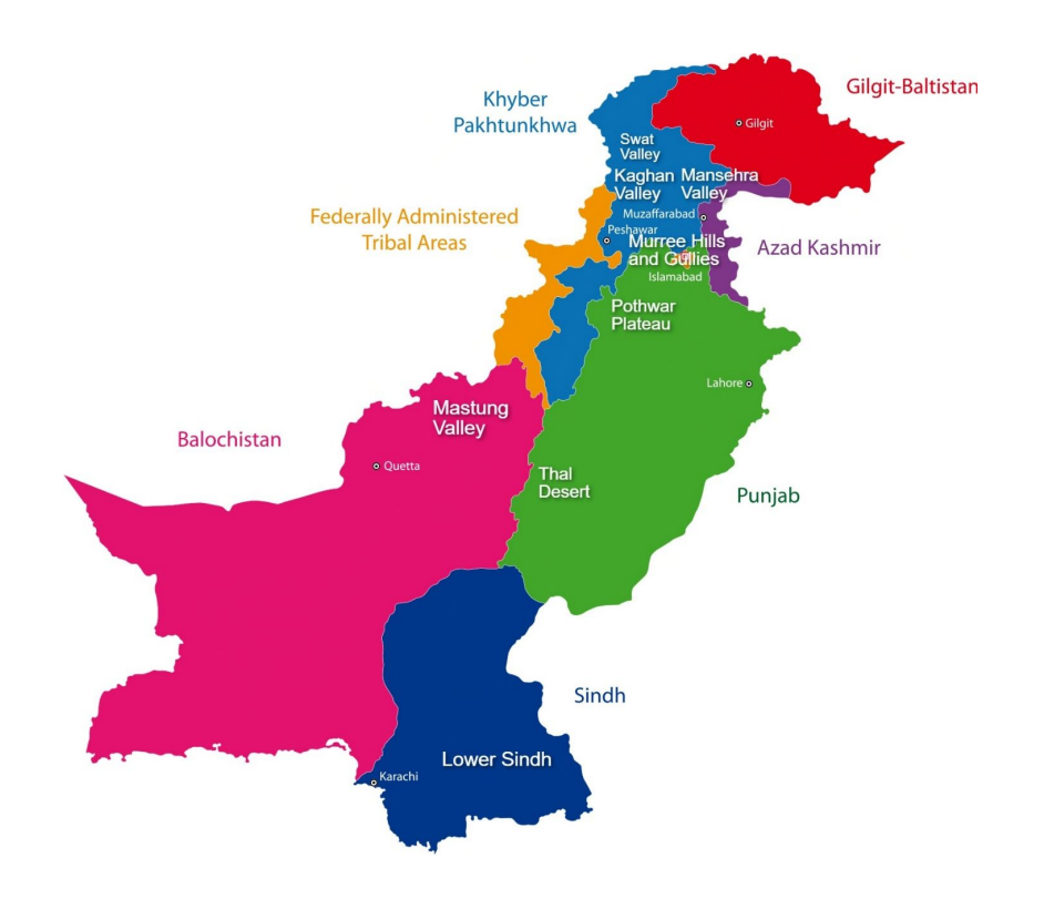
Fig. 2 Map of Pakistan indicating agroforestry initiatives taken at various locations. Map modified after Nile TV International (2019)