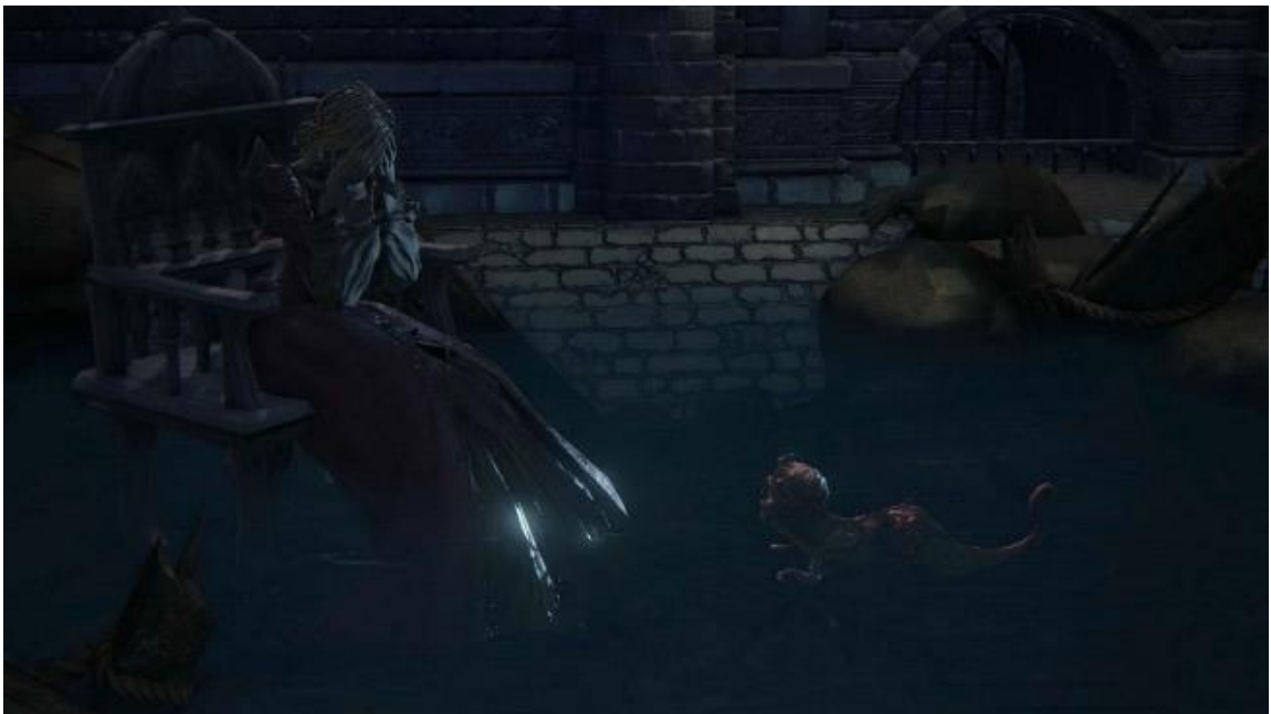
Figure 12. Arianna and her Great One child.

The player also learns that Queen Yharnam's womb was not the only womb that was "blessed." If the player has allowed the Imposter Iosfeka to live until after Rom has been defeated, he finds her upstairs in her clinic on her hands and knees on a gurney. She is moaning in pain and lost in her own madness. She says she feels things wiggling around in her brain. After killing her, she drops One Third Umbilical Cord, reinforcing the idea that she was a surrogate for a Great One. Arianna's womb is the last one to be used as far as the player knows. After defeating Rom, Arianna will tell the player she doesn't feel well. Eventually, Arianna will give birth to a small, winged worm-like "child" (see figure 12). Arianna is crying and is visibly upset. If the player kills the baby Great One, Arianna will also die—another transgressive woman to throw on the pyre.