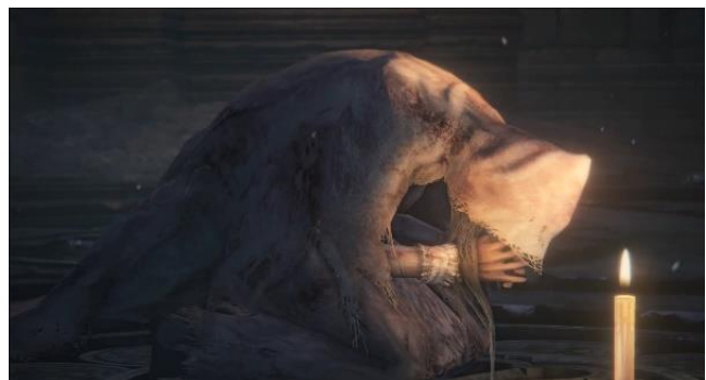
Figure 8. Vicar Amelia before her transformation.

Though Vicar Amelia expounds upon violence against women, she is also one of a few tragic female characters in Bloodborne . Vicar Amelia is the second mandatory boss fight in the game. Entering the Healing Church's Grand Cathedral and approaching the kneeling Amelia