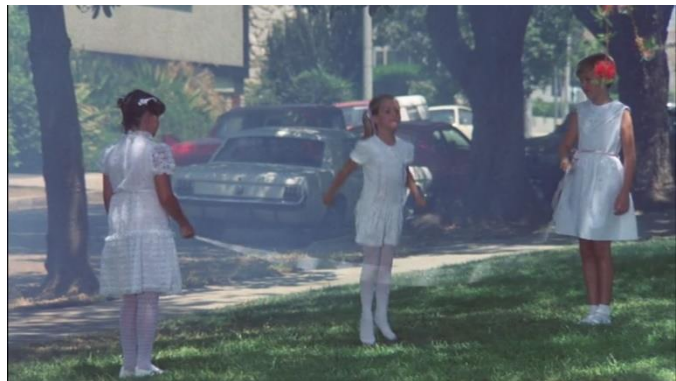
Figure 5. Little girls jumping rope.

strength either to stay the killer long enough to be rescued (ending A) or to kill him herself (ending B)” (35). Nancy does look death in the face and finds strength alone to stay the killer with the intention of killing him herself. But Nancy doesn’t quite manage to kill Freddy. After Donald and Nancy watch Freddy kill Marge, it appears that Freddy is gone. When Donald leaves, Freddy rises from the bed to attack Nancy again. At this point, Nancy has come to believe that Freddy is feeding off the fears of his victims (undoubtedly true) and that by taking that power away from him, by not being afraid, she can defeat him. As Nancy turns her back on Freddy, he vanishes and she appears to awaken in a perfect, sunny world. Nancy says she feels more refreshed and awake than she has in a long time. Marge is alive again and says she’s giving up drinking. Glen, Rod, and Tina pull up in a convertible to whisk Nancy away to school. As Nancy gets into the car, the hood comes up and the