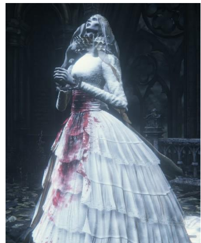
Figure 11. Queen Yharnam.

Of all the tragic, punished women in Bloodborne , Queen Yharnam has the least amount of screen time. The player sees her once after defeating Rom and then again as he ascends to kill the first of three final bosses – Mergo’s Wet Nurse. Each time the player sees Queen Yharnam, she looks the same: bloody, white dress with a ruffled collar, pale and sunken cheeks, black eyes, and