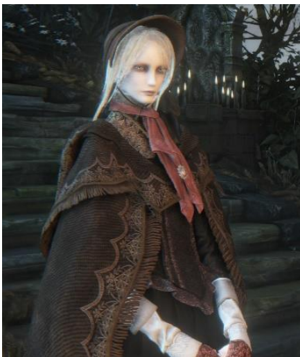
Figure 7. The Doll from the Hunter's Dream.

Dream, serving the Hunter is all the Doll does. Gehrman reiterates the fact that she is there for the Hunter when he says, “We don’t have as many tools as we once did, but ... You’re welcome to use whatever you find... Even the doll, should it please you...” ( Bloodborne ). Not only is this bit of dialogue from Gehrman overtly sexual, it tells the