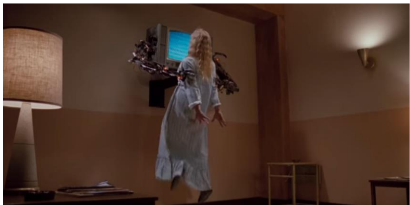
Figure 13. TV Freddy grabbing Jennifer.

hunter. She's taking control back of her narrative and asserting a more dominant identity, which until then had been mostly