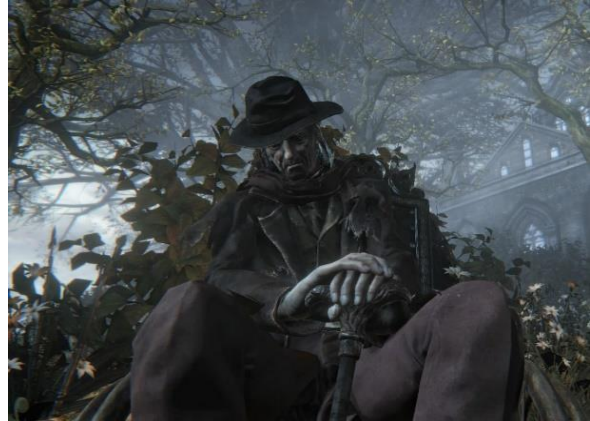
Figure 6. Gehrman.

inert. After gaining at least one point of insight, the Doll animates and allows the player to level up and also gives the player small bits of lore. The Doll is obviously and in some ways exaggeratedly feminine. She has long, white blonde hair and is wearing a gold-embroidered brown dress, a pinkish red kerchief and matching fingerless gloves. She is also wearing a bonnet and shawl that match her dress (see figure 7). She is there only to serve the Hunter. Beyond giving the Hunter small snippets of lore and praying at one of the graves in the