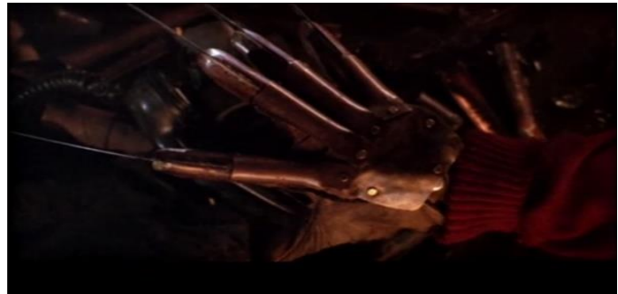
Figure 1. Freddy's glove.

imagery. If that was not enough, the film immediately drives the phallic point home when the razors literally penetrate and slash a canvas hanging in what appears to be a boiler room. The one notable