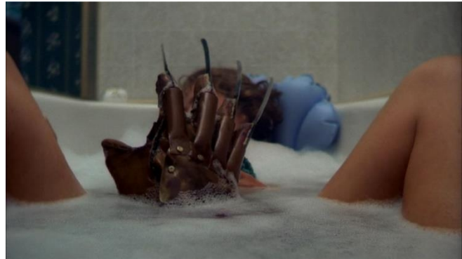
Figure 4. Freddy reaching up from between Nancy's legs in the bath.