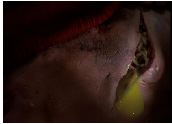
Figure 2. Freddy's slit abdomen.

The most obvious of these is when Freddy slits his stomach open in Nancy's first nightmare. When Nancy falls asleep in school and makes her way down to the boiler room, she encounters Freddy. She asks him who he is and, smiling, he lifts up his shirt