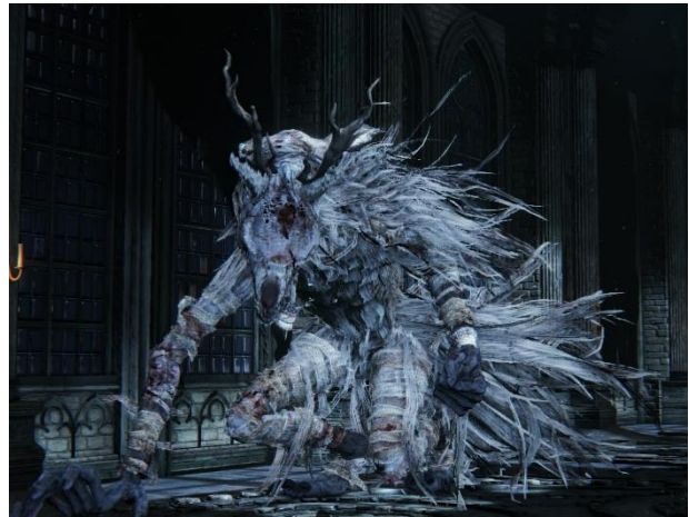
Figure 9. Vicar Amelia's beast form.

headpiece. She has also sprouted thin horns and gained a lupine snout and a huge mouth with an unusual amount of teeth (see figure 9). Vicar Amelia's appearance is more horrific than anything the player has seen thus far. Her appearance and the violence with which she transforms tells the player that not only are women monstrous but so is the Healing Church. The Healing Church making their vicar a woman was monstrous enough, having her literally transform into a beast only solidifies her and the Church's monstrosity, although order is quickly restored when the player kills Amelia. Amelia's death is much easier for the player to stomach now that she has transformed into a hideous beast.