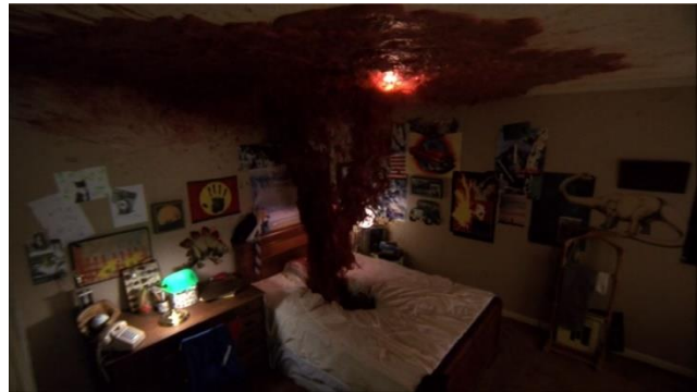
Figure 3. Blood shooting from Glen's bed after his murder.

already starting to be feminized from the moment he lies down. He is further feminized when a hole appears in his bed and he sinks, or is pulled, down into the hole where Freddy is waiting. After Freddy penetrates Glen (which the viewer does not see), blood geysers out of the hole in the bed (see figure 3). Not only is the blood shooting out of a hole in a feminine space is clearly menstrual, it is also a form of ejaculation for Freddy. It is his uncontrollable, horrific release after penetration. This ejaculation occurs from the gratification that Freddy gets from killing Glen, but it also demonstrates his excitement that he can finally move on to Nancy. He can finally penetrate Nancy with his masculinity.