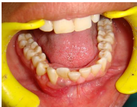
Figure 1(left) preoperative photograph

principles of implants placement. The grafts were placed over the recipient area and secured with 8 mm screws (fig.5). The surgical specimen consists of a portion of mandible and the teeth involved in the tumor, was sent for radiographic and histopathological examination which matched with the incisional biopsy report (fig.6).The postoperative course was uneventful. After four months, implant were exposed and secondary stability of the implant was checked with periodontal probe and was confirmed using resonance frequency analysis, which was found to be within normal limits and gingival formers were placed followed by full prosthetic rehabilitation of the patient. The patient is kept on follow up and till date after five years there is no evidence of recurrence(fig.7,8).