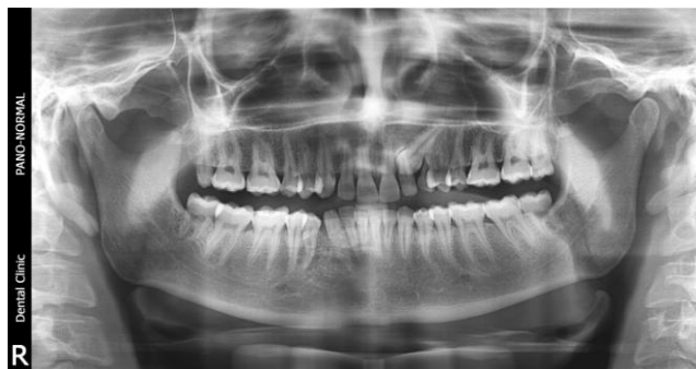
Figure 2(right) preoperative OPG