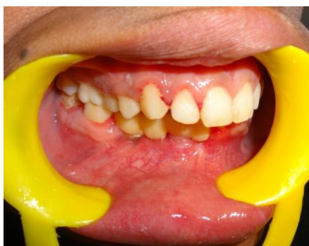
Figure 6(right) Prosthetic Rehabilitation