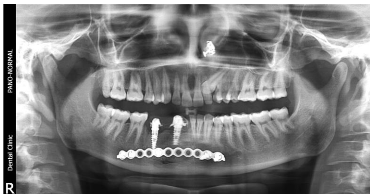
Figure 7 5 Years follow up OPG