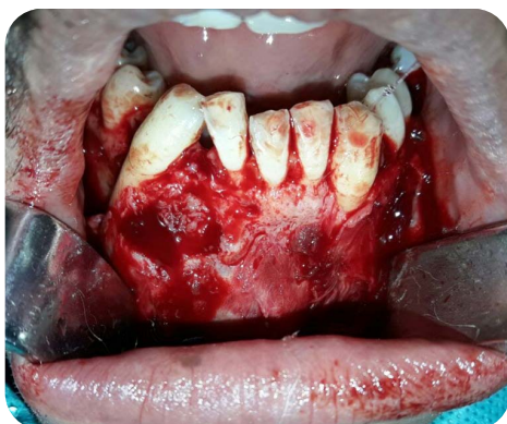
Figure 3 Intra-Oral View after raising the buccal flap with the lesion exposure and its emergence in the buccal cortical

A buccal flap was raised in order to expose the lesion (Figure 3). Then enucleation conservative treatment was then performed under local anesthesia with extraction of the 43 (Figure 4). Hermetic post-operative sutures were performed after the surgery (Figure 5). The lesion specimen was then sent for histopathological analysis. The pathology report showed follicular cells and concluded a Follicular Unicystic Ameloblastoma (Figure 6). The patient was then followed up over a period of one year with no pain or discomfort noted and no signs of recurrence (Figure 7).