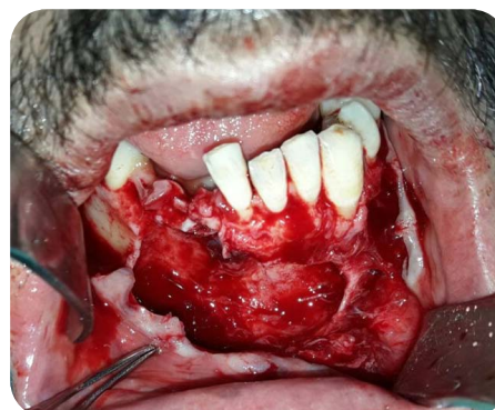
Figure 4 Intra-Oral View showing the lesion's cavity after complete enucleation and extraction of the 43