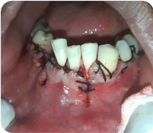
Figure 5 Post-operative sutures