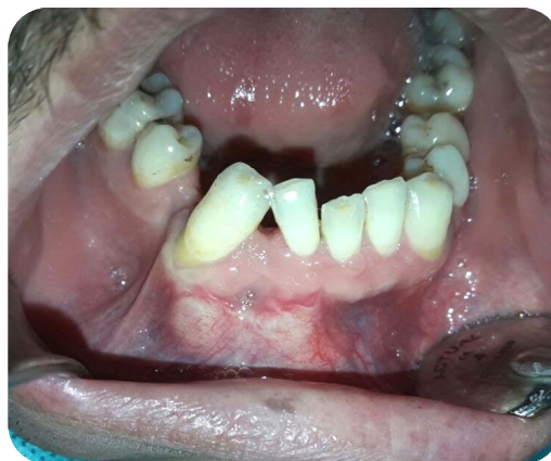
Fig 1 (A)