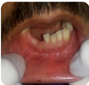
Figure 8 (A)