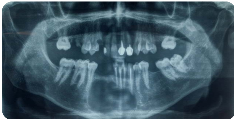
Figure 7 Follow-Up after one Month