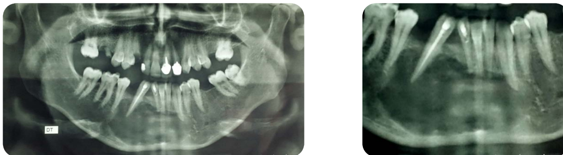
Figure 2 (A ) Orthopantomogram showing the extension of the unilocular radiolucent lesion from 34 to 45

(Figure 2 A). CT Scan was then performed and showed the extension of the lesion in the mesio-distal axis from the mesial side of 34 to mesial side of 45. It also revealed the buccal cortical expansion and the preservation of the internal bone cortical (Lingual) (Figure 2 B).