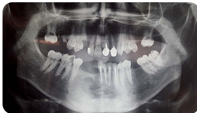
Figure 8 (B)