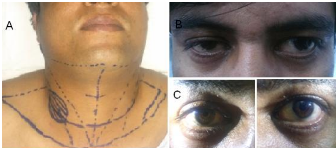
Figure 1 A. Preoperative markings of the neck showing mass and involved lymph nodes in the patient. B. shows the right sides ptosis and C. shows the right sided papillary constriction as opposed to left.

A 32-year-old male patient came to our department with complaints of right posterior triangle mass of the neck, drooping of right eyelid and anhydrosis of ipsilateral half of face for last 3 years. There was no significant family history of thyroid cancer.