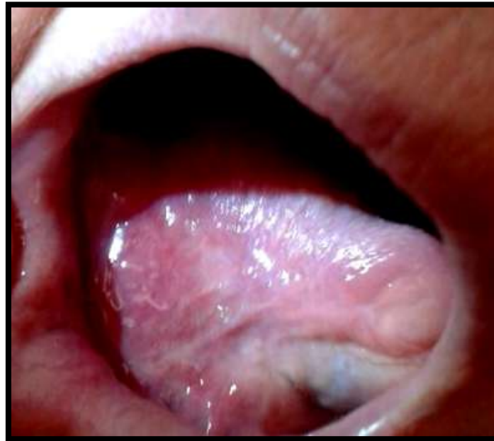
Figure 5 One month Follow-up after Surgery

The patient was referred to the maxillofacial surgery department for an adequate surgical management of the malignant lesion, and was followed up over a period of one month (Figure 5).