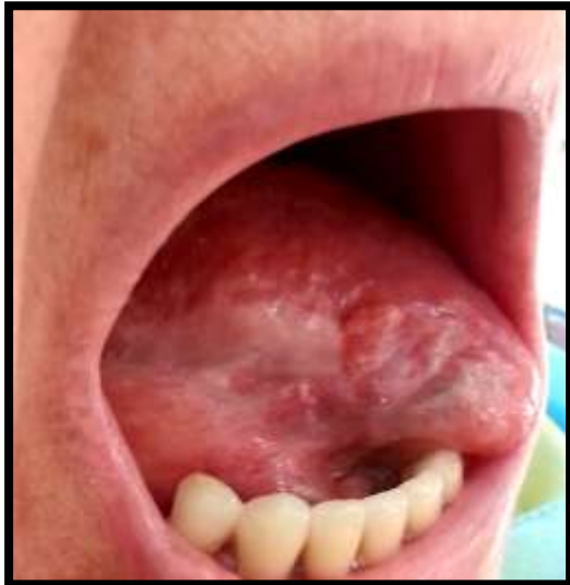
Figure 3 whitish elevations, lesions stand out and have an erosive appearance located on the right side edge of the tongue before the second biopsy, suspecting an Oral Squamous Cell Carcinoma.