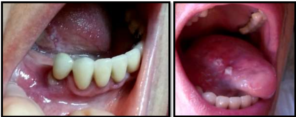
Figure 1 (A)

The intraoral clinical examination showed the presence of whitish lesions in the form of plates sitting across the right side edge of the tongue, with the presence of gingival ulceration next to the right premolar-molar sector (Figure1: A+B). A biopsy was performed and concluded an oral mucosal lichen planus (Figure 2).