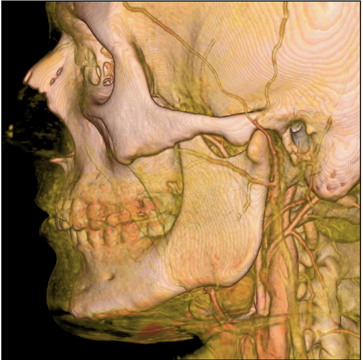
Fig 2. The computed tomography angiography (CTA) of the external carotid artery with three-dimensional (3D) volume-rendering showing typical single transverse facial artery (TFA) with masseteric branches. Black arrow indicates TFA.

https://doi.org/10.1371/journal.pone.0211974.g002