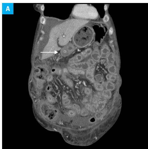
FIGURE 1 A – thickening and contrast enhancement of the alimentary tract mucosa with visible pyloric stenosis (arrow) and free fluid surrounding the liver; gastric retention is visible.

After 2 months of temporary improvement, the patient was readmitted due to signs of pyloric stenosis (vomiting after each meal), confirmed by a follow-up gastroscopic examination, which revealed a rigid and narrow pyloric canal. Histopathology was concordant with earlier findings