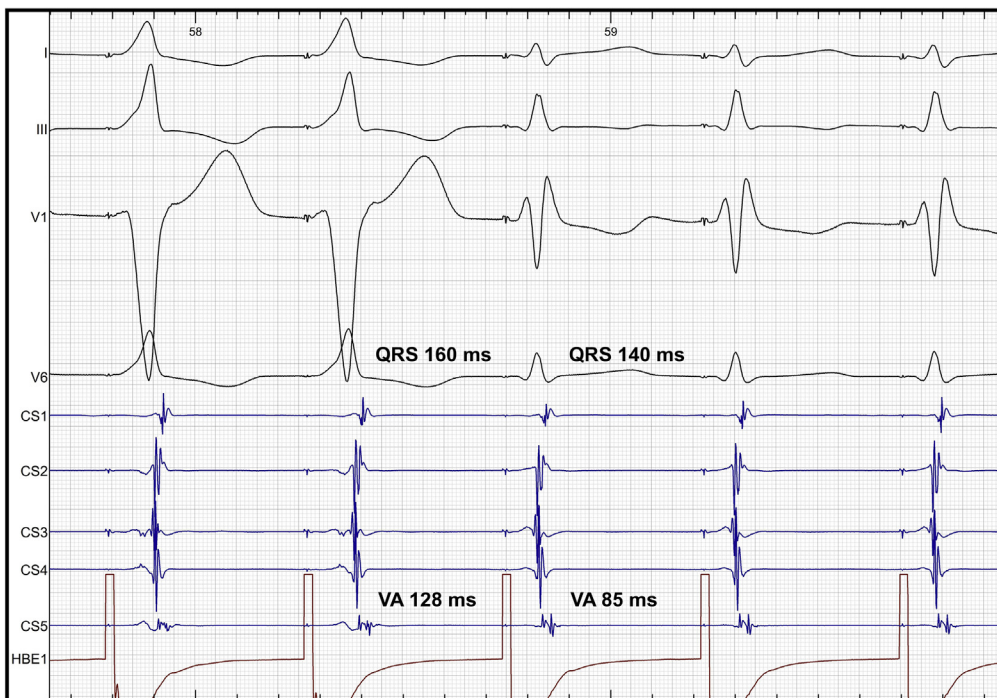
Figure 2 Para-Hisian pacing with increase in pacing output. The first 2 QRS complexes of left bundle branch block morphology result from pure right ventricular myocardial capture. Subsequent narrower QRS complexes of right bundle branch block morphology represent His bundle capture proximal to the site of block in the right bundle. Narrowing of the QRS complex with His bundle capture corresponds to shortening of the ventriculoatrial (VA) interval from 128 to 85 ms. CS1 to CS5 represent proximal to distal coronary sinus electrodes.

(Figure 1). Such a response to para-Hisian pacing is considered indicative of retrograde conduction via an AP. However, in the present case this was a variant of the nodal response.