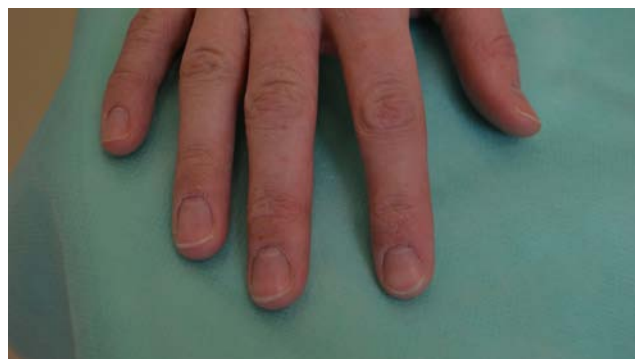
Figure 1. Erythematous-squamous skin lesions occurring on hands

places on the back of hands and between fingers there were erythematous lesions with superficial exfoliation of the epidermis; single, deep fissures, reaching the dermis, were observed on finger tips [Fig. 1]. In the allergologic history, the patient reported an allergy to plant pollens, confirmed by prick tests. In order to enhance the diagnostics, classical epidermal patch tests were prescribed, with the ‘True test’ basic set. Contact allergy was not confirmed. ‘Prick-by-prick’ tests were prescribed concerning food often used in the household (carrot, celery, rye flour, wheat flour, cows’ milk, hen egg, apple, tomato, banana, orange, cocoa, potato). Positive results of the prick-by-prick test were observed for potato (wheal/erythema 10/30 mm; ++++), positive control – histamine 6/15 mm, negative control – saline 0/0 mm [Fig. 2]. Based on the above results, contact eczema induced by potato protein was diagnosed. Allergen elimination and use of emollients were prescribed. A complete remission of skin lesions was obtained.