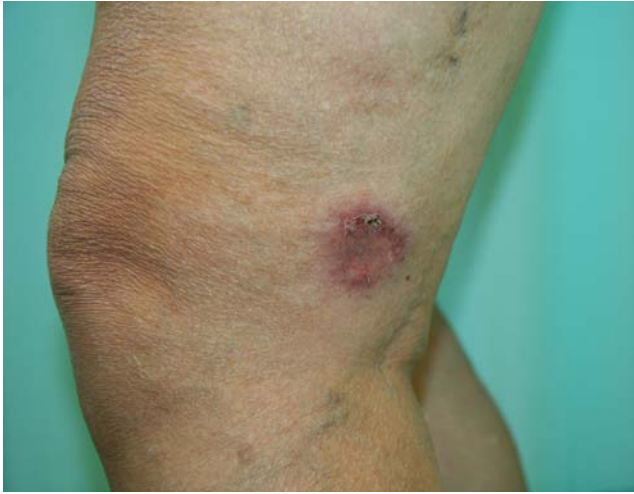
Figure 1. Plaque localized above the left knee