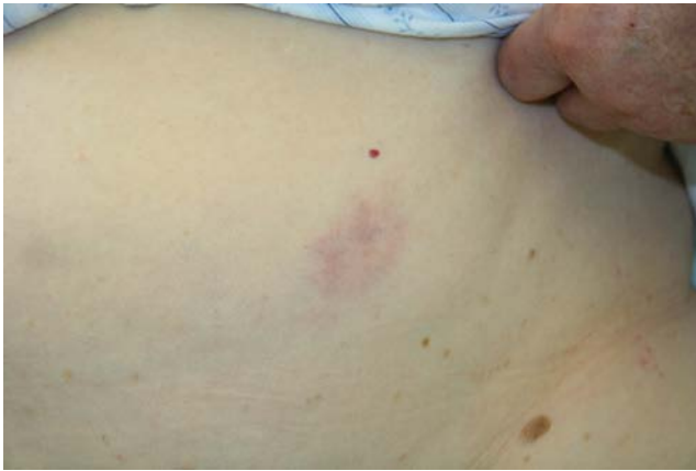
Figure 2. Smaller lesion on the trunk