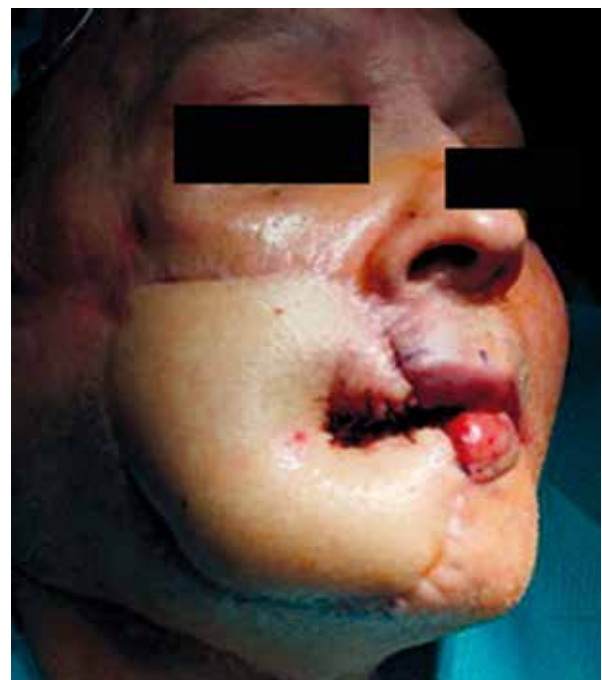
Figure 6. Reconstruction of the mouth

and easy for a skilled surgeon. Large and long pedicle, with a diameter close to potential recipient vessels of the head and neck make the microvascular anastomosis safe and easy. Harvesting ALTf is related with minimal donor site morbidity. The motor weakness is mild and transient,