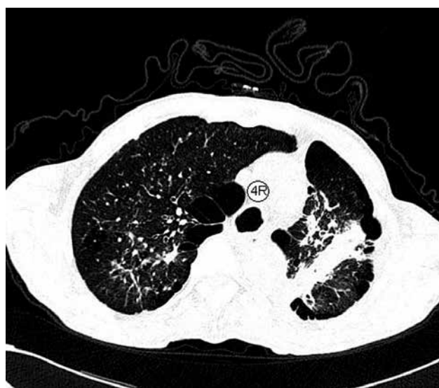
Fig. 5. Chest tomography (pulmonary window) – emphysematous bullae adhering to the mediastinal lymph nodes

Pneumothorax may result from injury of the pulmonary pleura of a previously unchanged lung or from an accidental puncture of an emphysematous bulla during the needle biopsy. In patients with bullous emphysema, this complication may occur as a result of a spontaneous rupture of an emphysematous bulla, caused by an increase of pressure in the chest resulting from strenuous cough during bronchofiberscopy.