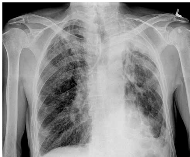
Fig. 4. X-ray of the chest after removal of the drain – normally expanded lungs

Approximately 30 min after the end of the endoscopic examination, the patient reported sudden pain in the right half of the chest, accompanied by dyspnea. Physical examination revealed tachypnea, no alveolar murmur above the right side of the chest, and tympanic resonance. The obtained chest radiogram visualized right-sided pneumothorax and mediastinal displacement to the left (Fig. 3). During the diagnostic examinations, the patient's condition deteriorated: he lost consciousness, his arterial blood pressure dropped to 50/20 mmHg, and his heart rate slowed to 30 bpm (bradycardia). A drain was immediately inserted into the right pleural cavity, and suction drainage was applied, resulting in swift improvement of the patient's condition. Further radiograms confirmed full expansion of the right lung (Fig. 4). The drain was removed on the 4 th day; on the next day, the patient was discharged home in good general condition.