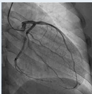
Figure 2. Coronary angiography left coronary artery