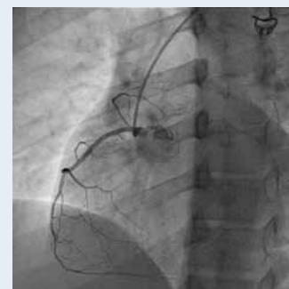
Figure 3. Coronary angiography right coronary artery