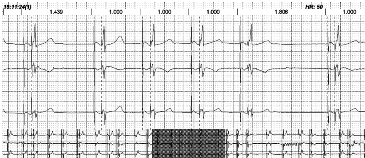
Figure 1. Holter electrocardiography (ECG) monitoring results. Predominant cardiac rhythm from DDD pacemaker ca. 60 beats/min. After first and fifth heartbeat, pacemaker inhibition is present, reaching over 1.4 second and 1.8 second. There is no artefact associated with myopotentials in this ECG recording

pacemaker inhibition? Does the patient need any further clinical evaluation or management?