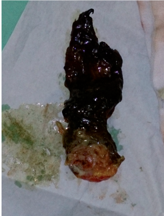
Fig. 3. Necrotic rectum.