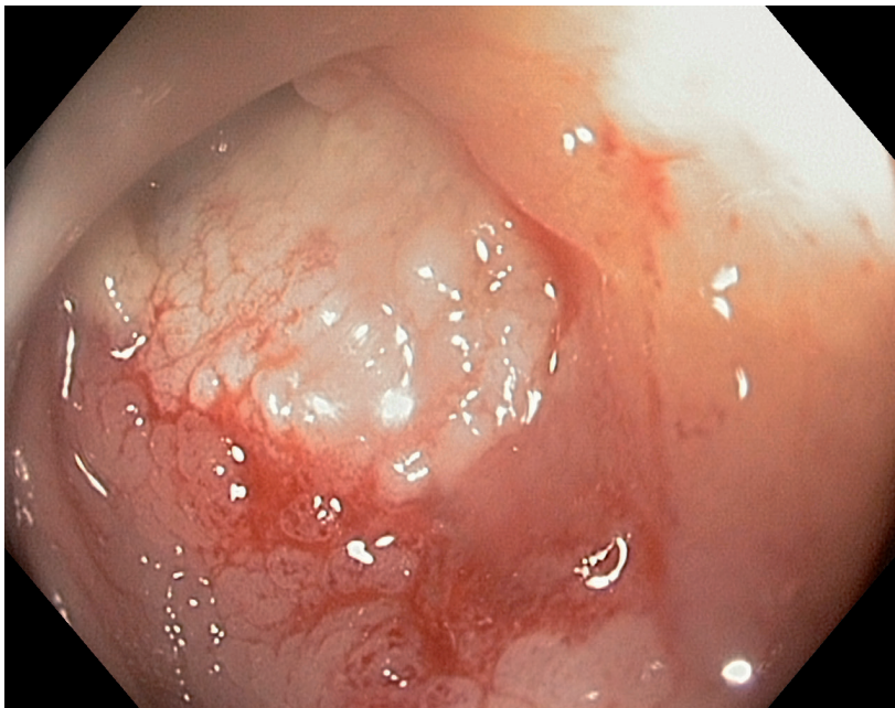
Fig. 1. Cylindrical infiltration with ulceration.