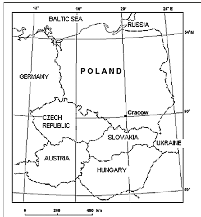
Figure 1. Study site localization

Pollen data were collected in Cracow using the volumetric method recommended by the European Aerobiology Society