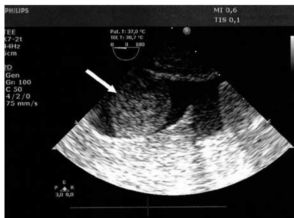
Photo 1. Two-dimensional transoesophageal echocardiographic image of atrial tumour thrombus (arrow)