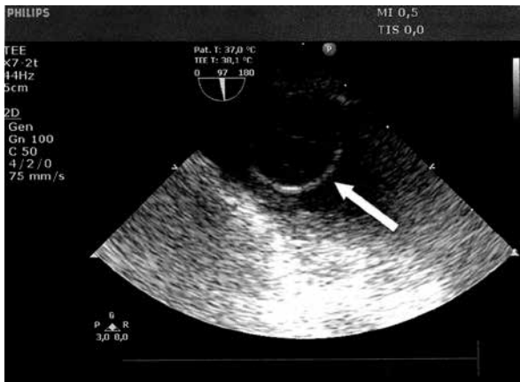
Photo 2. Two-dimensional transoesophageal echocardiographic image of inflated balloon of the catheter within the right cardiac atrium (arrow)

ning suture. The patient remained haemodynamically stable with no evidence of emboli noted on TOE. The total vessel occlusion time was 90 s. The blood loss, measured from the time of the IVC incision until the cavotomy closure, was approximately 1000 ml. The first 200 ml of blood was lost at the time of catheter positioning into the right atrium with a balloon just above the tumour thrombus. Minimal bleeding (< 50 ml) occurred during catheter-guided thrombus withdrawal and approximately 750 ml of blood was lost during cavotomy closure. No Pringle’s manoeuvre was required to control the hepatic backflow. The total surgical time was 220 min.