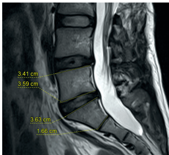
Figure 1. Upper and lower end-plates of L5 vertebrae and S1 vertebrae were measured