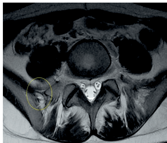
Figure 4. The iliolumbar ligament was determined from the axial slices (circle), and the vertebra to which it was attached was noted

When the images were evaluated, patients with a compression fracture ( n = 4 ) or severe osteophyte formation ( n = 7 ) were excluded from the study to avoid misreading the vertebral form. The square/rectangular vertebrae were evaluated as lumbar vertebrae and the trapezoidal vertebrae as sacral vertebrae.