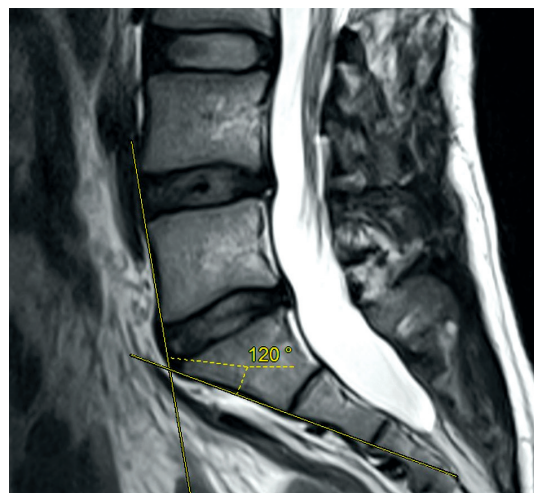
Figure 2. The angle between the upper and lower borders of the last prominent disc was measured