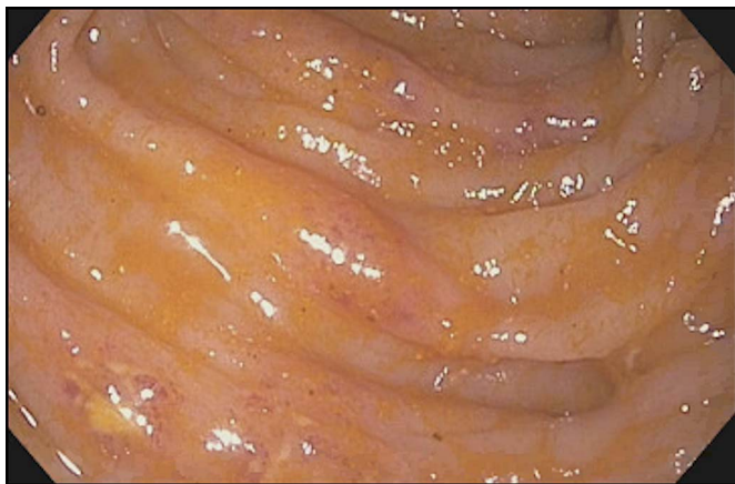
Figure 4. Sigmoidoscopy showing patchy distribution of pseudomembranes on day 22, consistent with improvement.

an ANC <500/\mu\text{L} without any adverse events. It may not be necessary to delay FMT for safety reasons in critically ill patients until the neutrophil count recovery is achieved.