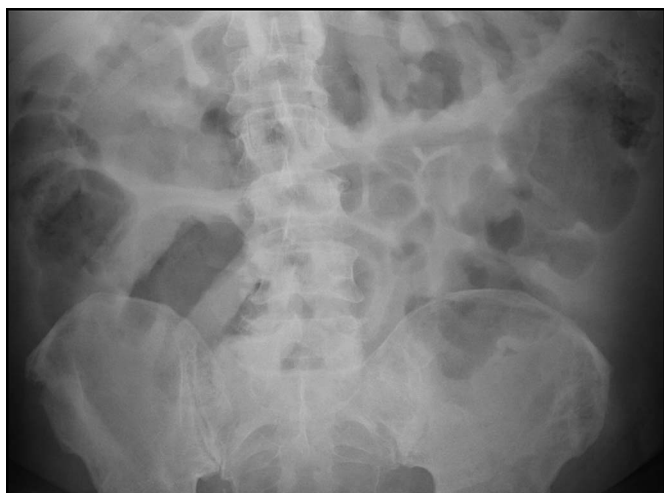
Figure 2. X-ray showing progressive colonic dilation consistent with toxic megacolon.

a FMT via flexible sigmoidoscopy was pursued. Colon preparation was deferred given the patient's tenuous clinical status and lack of oral intake. The initial endoscopy showed dense and diffuse pseudomembranes, and FMT was performed with frozen/reconstituted stool obtained from the OpenBiome stool bank (Figure 3). The antimicrobial regimen was continued up to and after the procedure.