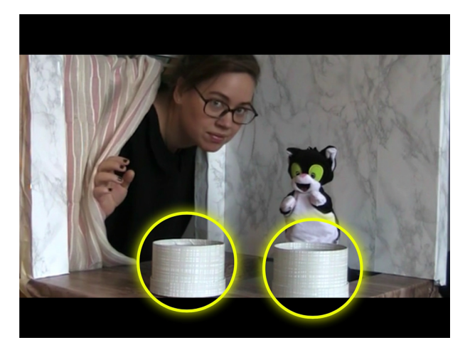
Fig. 1 A screen dump from the FB task with "Johanna" and "Jansson the Cat". The child answers the questions (i.e., "Where will Johanna look for the ball?" and "Where is the ball?") by pointing at one of the yellow circles on the touch screen

questions are asked: the FB question "Where will Johanna look for the ball?" and the control question "Where is the ball really?" The ball systematically changes places from left to right.