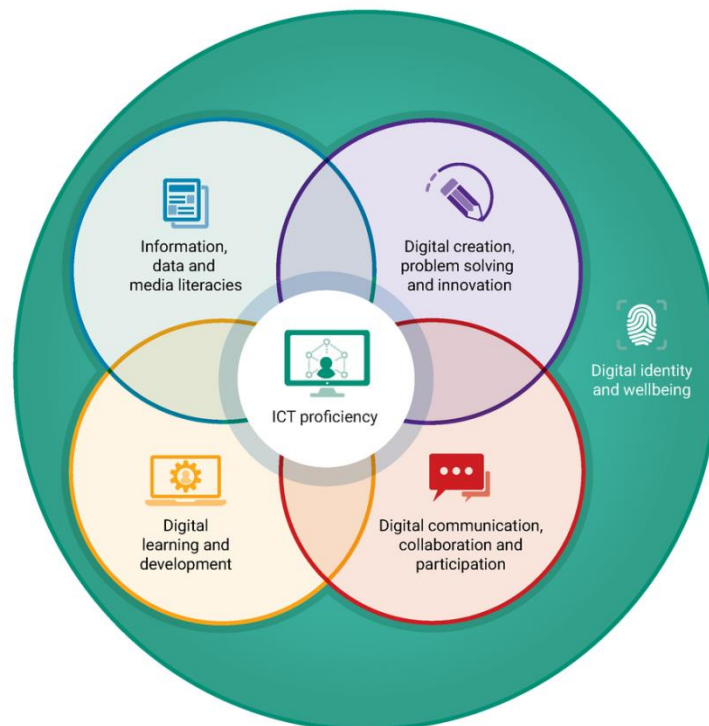
Figure 1. Building digital capabilities: the six elements defined (Jisc 2017)