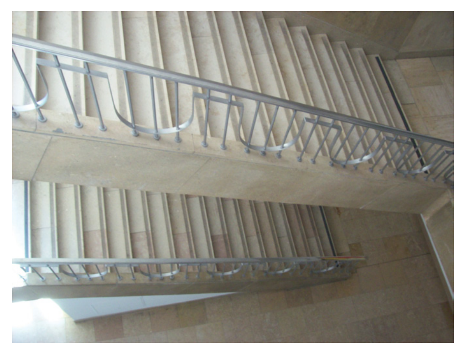
FIGURE 7 Nazi-era banisters inside the Federal Finance Ministry.

features from different periods such as the banisters (figure 7), the paternosters, door handles and bookcases are highlighted by the guide and used as jumping off points from which to talk about the building's previous uses. These very conscious efforts to provide such detailed accounts of the renovation to the general public are indicative of the significance of this palimpsestic approach in forming part of the present's response to the past. Through this response, the traces of dictatorship have been neatly ordered and regulated and are used as a platform upon which the present and past uses are juxtaposed. The physical traces of dictatorship are thus appropriated by the present; they are differentiated from their surroundings, marked out as other, and used as a counterfoil for the democratic Federal Republic.