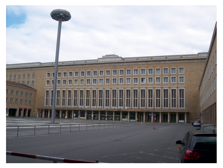
FIGURE 4 Ernst Sagebiel's Flughafen Berlin-Tempelhof (begun 1936).

Third Reich meant that they did, in due course, demand a particularly conscious, definitive response, and they thus provide an ideal platform from which we can explore the development of these responses. The article will begin by exploring the post-unification debates around each of these buildings. In particular, it will highlight how each one came to be under the spotlight, which aspects of their physical fabric or their history were problematized, and the suggestions mooted for countering these elements. In doing so, it will demonstrate that the contests around the material legacies of Nazism are not solely, or even necessarily primarily, informed by the trace itself, but by myriad other factors: the postwar use of the building and its relationship to Cold War memory politics; the level and nature of media attention; and the function of the building and the different expectations engendered by those functions. Through interrogating this unevenness in conceptions of the traces of National Socialism, it will reveal the extent to which the problematisation of heritage is a process, rather than an already-existing, inevitable status for buildings with connections to past dictatorship or atrocity. The second part of the article will focus on the strategies ultimately implemented at each of the buildings. It will show that, despite the differences between the popular conceptions of the buildings highlighted in part one, the attempts to deal with each site were