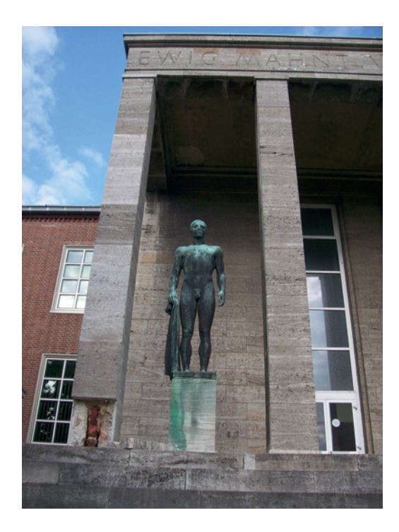
FIGURE 5 Arno Breker's Zehnkämpfer (1936).

for Berlin to prioritise the need for a modern sports facility that could compete on the world stage.<sup>35</sup> Another distinction is that the discussions about how the traces of dictatorship at the Olympic Stadium should be dealt with were much more nuanced. Rather than addressing the site as whole, particular features were identified as more problematic than others and, as a result, a more differentiated rhetoric developed around the individual elements of the site's National Socialist layer.