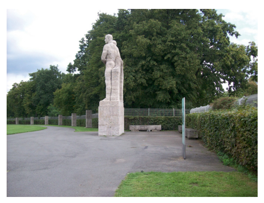
FIGURE 8 Karl Albiker's Diskuswerfer (1936) and information board.

altered during this process, their materiality is affected by the signposts, which are generally situated within close proximity to the corresponding sculpture. As well as instantly identifying the related piece as 'problematic', the signposts have an impact upon the spatial configuration around the sculptures, often mitigating their monumentality or diminishing their function by highlighting the axiality of the overall composition of the Olympic Complex.