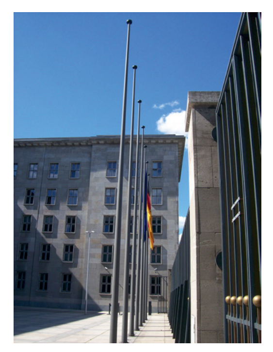
FIGURE 2 Ernst Sagebiel's Reichsluftfahrtminis terium (1935–1936).