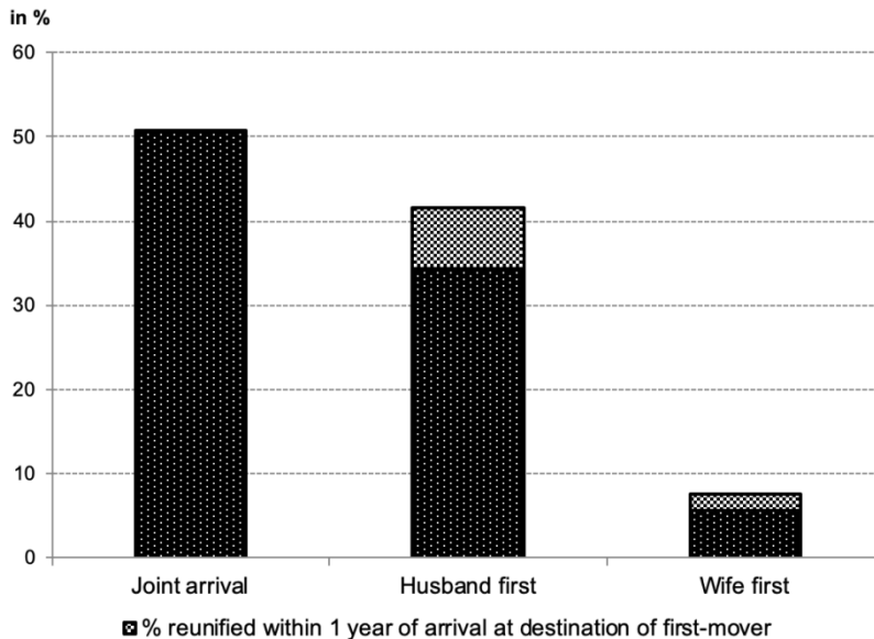
Figure 2: Order of spousal migration and share of reunified couples

Data: IAB-BAMF-SOEP, waves 1 & 2, 2016-2017 (weighted percentages).