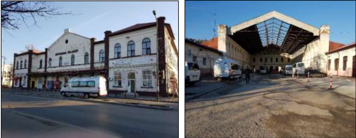
Figure 9 and 10. Filaret Train Station, currently the Filaret Bus Station

Around this train station multiple industrial complexes have been built because of the proximity to it which could provide them with resources for production. Currently, through renovations and assigning touristic functions, this area could bring back a part of the city's mood during that time, when this area was strongly industrialized.