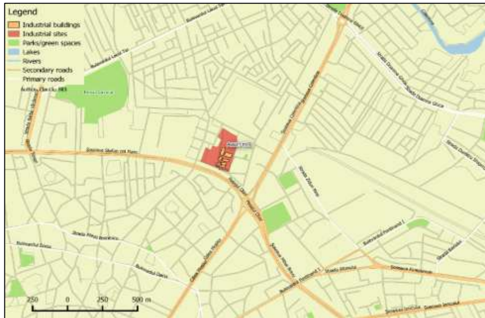
Figure 16. The location of the Assan Mill complex

In 1906, aside from the famous mill which milled each day a huge quantity of wheat (7 cars of wheat), so much in fact that the flour could be used to feed 100.000 people, there is also a vegetable oil factory, a paint factory, another for agricultural machinery fats and another for coconut extract. (Giurescu, 2009, pp. 338; Cercleux et al. 2012; Pippidi, 2012, pp. 266). The imports necessary for those factories came from many countries such as: Africa, Australia and New Zealand (Cercleux et al. 2012; Pippidi, 2012, pp. 266), which means that this mill wasn't just the first mill powered by a steam engine, but also represented an important economic nucleus at that time, offering many jobs to residents and developing the northern part of the town.