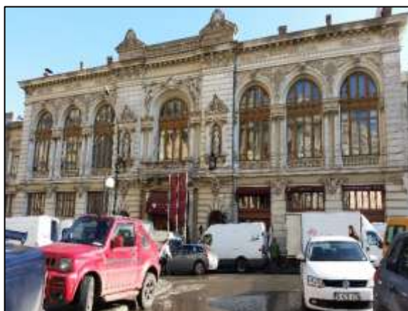
Figure 3. Bragadiru Palace

which is part of the complex is the best preserved part of it, and it is a true architectural masterpiece with a refined neoclassicism with renaissance elements. The Palace was built later and it served as the palace in which the beer was served, shows were being held, and other events for the workers, and it is the only building in the complex (Figure 4) which is still in use, it can be rented for all kinds of events such as weddings, baptisms, balls etc. (Dușoiu, 2014; Cercleux et al. 2012).