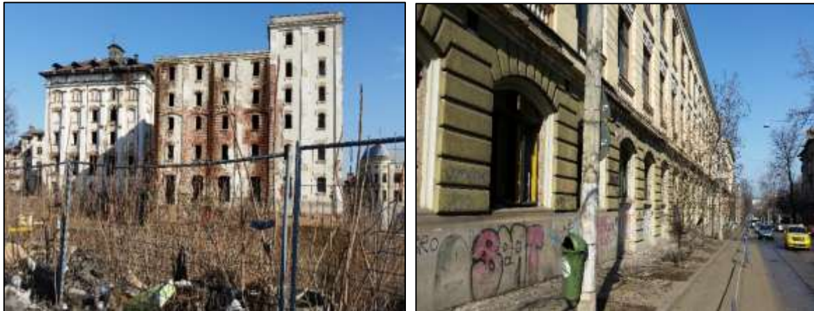
Figure 5 and 6. Buildings from the Bragadiru Brewery complex

Why open a beer museum in Bucharest? Well, the Bragadiru Brewery was founded in 1894, and buildings were still raised in the area until the years 1948 (Chelcea, 2008, pp. 129; Giurescu, 2009, pp.338; Cercleux et al. 2012; Duşoiu, 2014; Merciu et al. 2014), which makes this brewery, one of the oldest beer breweries in Bucharest, together with the Oppler Brewery built in 1870, which currently does not exist anymore, and the Luther Brewery opened in 1869 (Giurescu, 2009, pp.326), which has only 3 buildings left. Among these 3 breweries who were competing during that time, at the start of the 20th century, the Bragadiru Brewery reigned supreme in regards to production and equipment (Cercleux et al. 2012), overtaking the older breweries Luther and Oppler. Liviu Chelcea (2008) noted that at the beginning of the 20th century the brewery had a 120 HP steam engine and around 60 workers (Mucenic 2006 quoted by Liviu Chelcea 2008, pp. 147), which proves the huge production output of the brewery and also that it offered a large number of jobs.