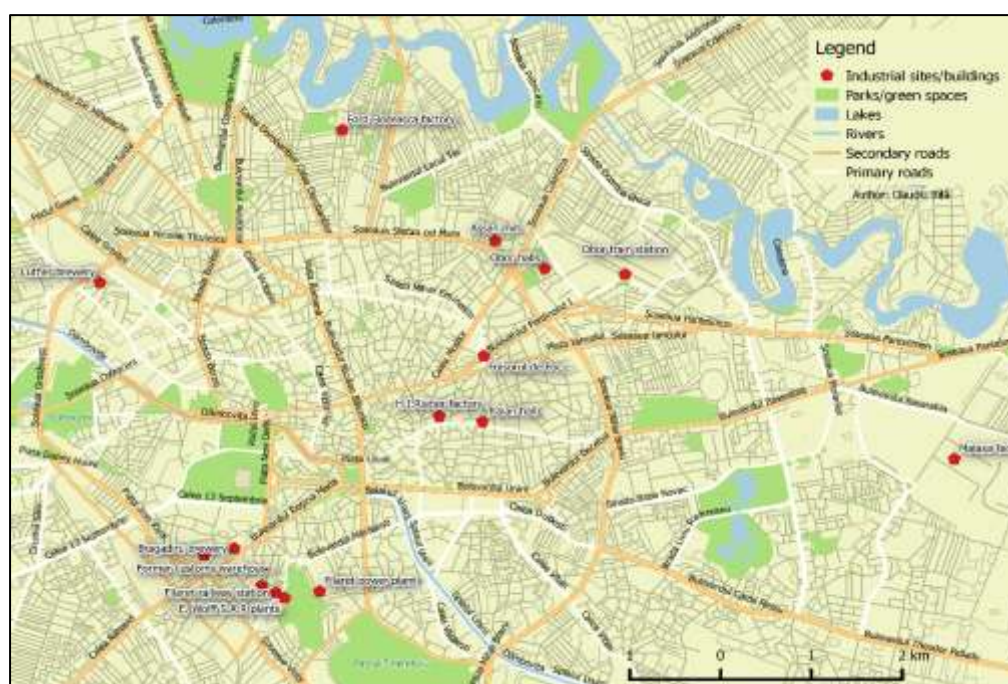
Figure 1. The main industrial sites/buildings included in the analysis

questions is in accordance with the study (Table 1), and their purpose is to test the way in which the people answering the questions see the industrial heritage and the possibility of converting it.