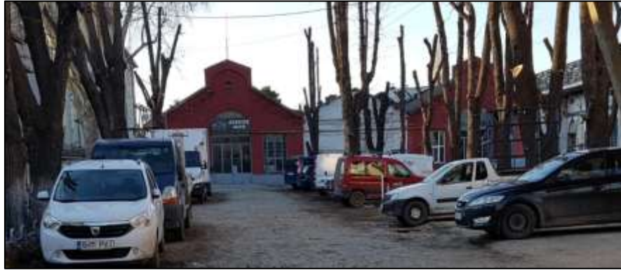
Figure 11. Buildings of the old matchstick factory, renovated using colors that do not match the original design

would be simple to create exhibits, considering that products from this factory are readily available, and the museum could even show the evolution of humanity's methods of creating fire, from its beginnings and until the invention of the matches, which were the most used tool for starting a fire in the 19th and 20th centuries, and until today's tools were created.