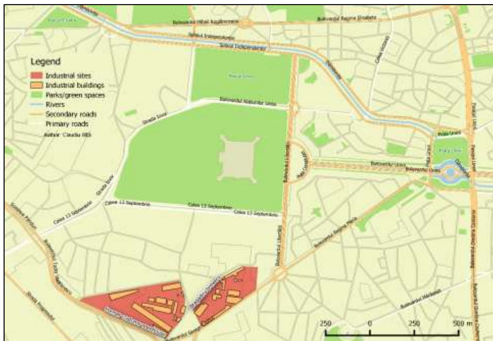
Figure 2. The localization of the Bragadiru brewery (west of it: the Old Customs Warehouse)

The Bragadiru Brewery. Among the objectives in Bucharest's industrial heritage, the biggest potential is owned by the Bragadiru brewery (Figure 2), both through its almost completely central position, but also through the current state of its building, which despite degrading, could be renovated much easier than Assan's Mill, for example.