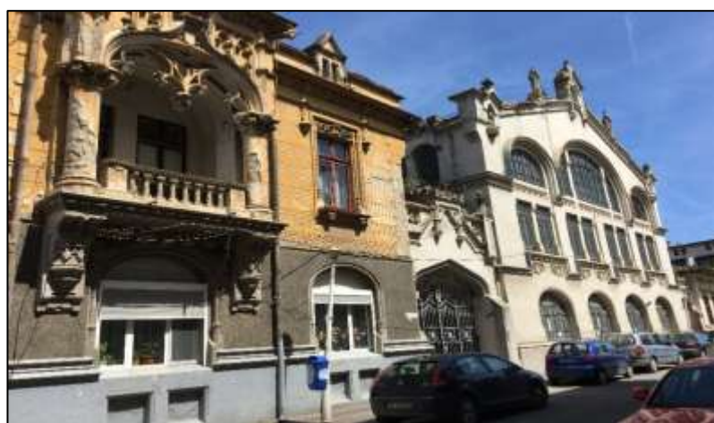
Figure 20. The home (left) and the carriage factory (right) of H. I. Rieber

The building in the neo-gothic style with moorish and byzantine influences, looks more like a palace rather than a simple carriage factory from the beginning of the 20th century (Figure 20). Attached to this factory is the home of its owner to its left, the home is also in a neo-gothic style, which makes this small ensemble even more unique, which is only enhanced upon by the fact that it's the only factory in a neo-gothic style in the country.