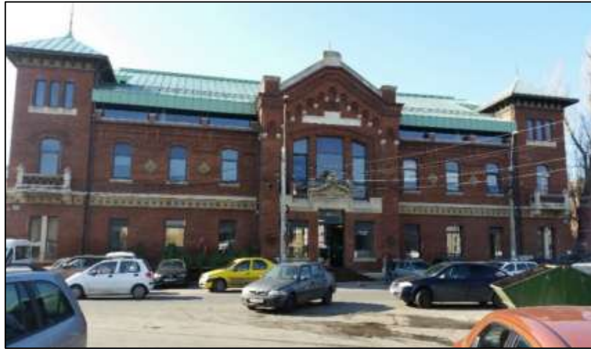
Figure 7. The Old Bucharest Customs Warehouse

The Old Bucharest Customs Warehouse. Also considered almost a part of the Bragadiru Brewery Complex because of its close proximity (opposite of it on the Calea Rahovei street) is the old Bucharest customs warehouse (Figure 7), whose construction started at the end of the 19th century and ended during the first half of the 20th century. (Cercleux et al. 2012; Merciu et al. 2012). Besides the main building which is an important example of industrial architecture, part of this complex are also a series of halls and warehouses, and one of the oldest water towers in Bucharest, which also keeps its architectural design like the other buildings in the ensemble.