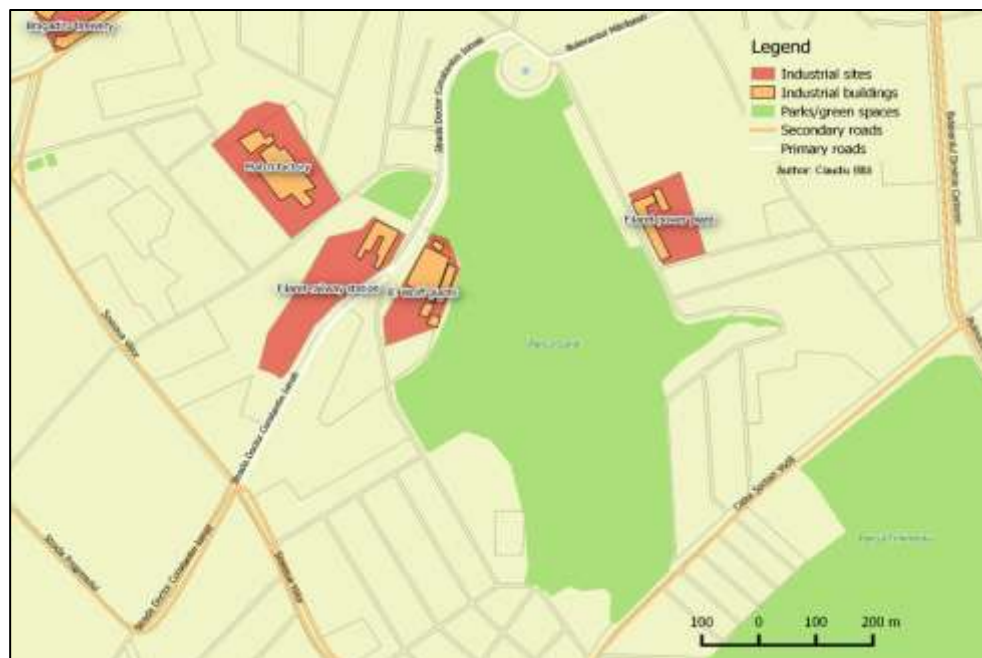
Figure 8. The main industrial complexes in the Filaret Area

The Filaret Area. I chose to talk about the Filaret Area (Figure 8), because here we have multiple industrial objectives with potential, which through renovation and by being assigned touristic functions can lead to the development of tourism in this part of the city.