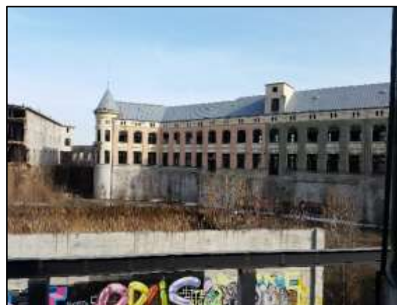
Figure 4. Inside the Bragadiru Complex