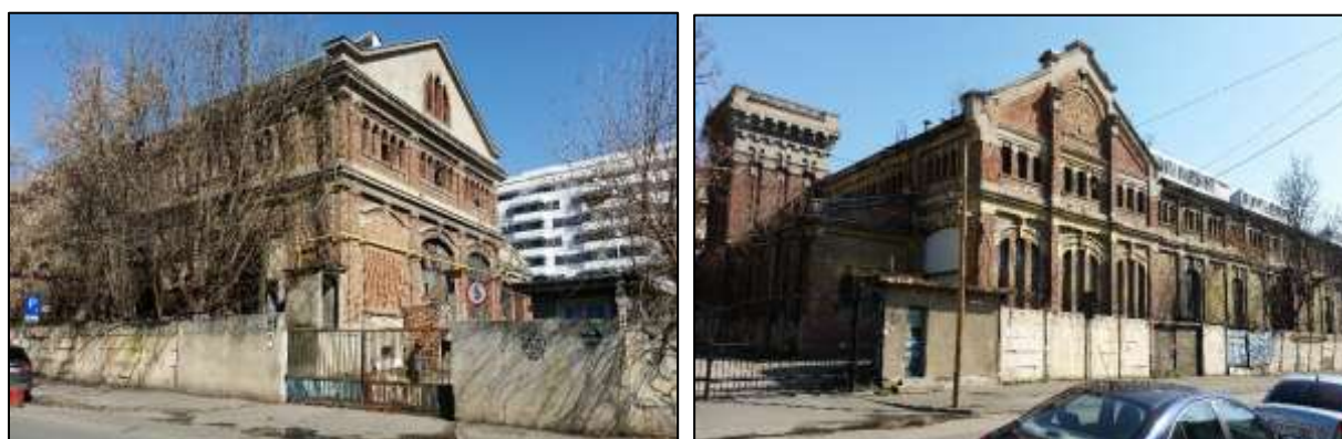
Figure 12 and 13. The building of the first power plant in Bucharest

Bucharest's first power plant. On the other side of Carol Park, on the General Canadiano Popescu street, close to the old Filaret train station and opposite of the Dimitrie Leonida Technical Museum, lies Bucharest's first power plant (Figure 12, Figure 13). Which keeps its authentic architecture with arches at the frontons and imposing architectural details. The combination of the bricks with the masonry (Dușoiu, 2014), which are easy to see from the outside as well, combined with the iron in the upper part of the interior and with the imposing presence of the two water towers, transform this building into a true industrial fortress with a very high degree of architectural attractiveness. The building is in excellent condition, considering it's over a century old.