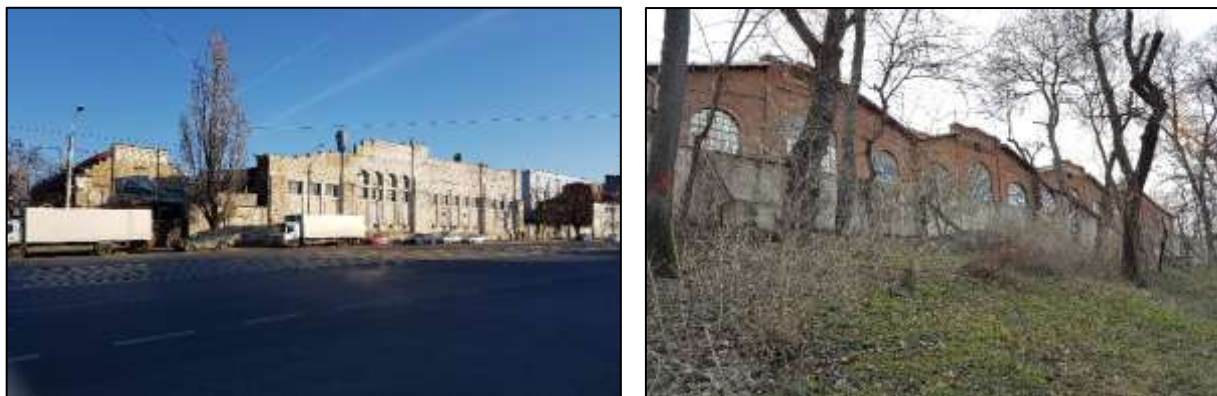
Figure 14 and 15. Buildings of the old E. Wolff S.A.R factory

does not exist. But through reconditioning all the points mentioned previously, this area which has not been able to find a concrete economic function since it ceased industrial activities, could become one of the most sought after places for tourism, which could immerse tourists into Bucharest's industrial period, while also offering a lush, green space in the form of Carol Park, which could be an attractive central point around which an entire industrial history could revolve.