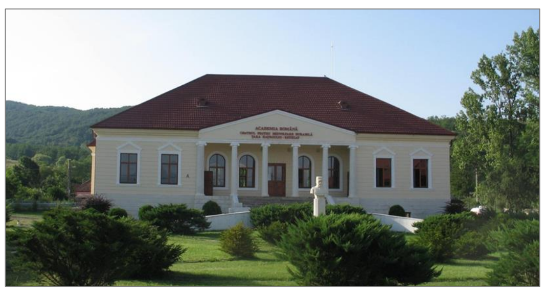
Figure 6. The Nopcsa manor from General Berthelot (Cepraga, July 2014)

Another family which came to be famous in the 19th century is Nopcsa. The Magyar nobles possessed two manors in General Berthelot and Săcel together with another propriety in Densuş. The castle from Săcel was built by a Romanian family and was lost to the baron Franz Nopcsa as a result of some debts (Muntean 2013). The castle was confiscated by the Romanian state after 1918 as with the majority of the Hungarian properties from Transylvania. In the communist period, a special school for orphan children functioned here. The same fate had the manor from General Berthelot (at that time Fărcădinul de Jos), which was donated by the Romanian state to the French general Henri Mathias Berthelot for the assistance provided during the First World War (Nicolae & Suditu 2008). At his death, the general donated it to the Romanian Academy, but in the communist period there was located the headquarters of the local co-operative farm<sup>2</sup>. After the 1989 revolution, the Romanian Academy received the edifice and renovated it in 2010 (Figure 6).