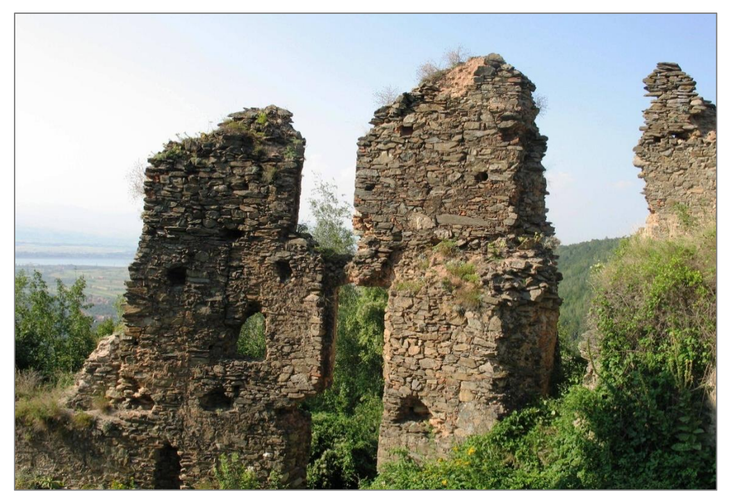
Figure 3. The ruins of Colt Fortress (Cepraga, August 2014)

Its example was immediately followed by the most influential noble families from Țara Hațegului. In the following centuries several other strongholds were attested. The most famous is Colț Fortress which was built by the Kendeffy family at the end of the 14th century (Popa 1988) (Figure 3). The stronghold is located on a ragged mountain cliff, just above the southernmost village from the valley. Its original purpose is not precisely known, but historians believe that it was probably a refuge and a good observation point of the family's possessions. The considerable size of the fortress matched the wealth and the influence of the Kendeffys and could have been used as a symbol of their regional power.