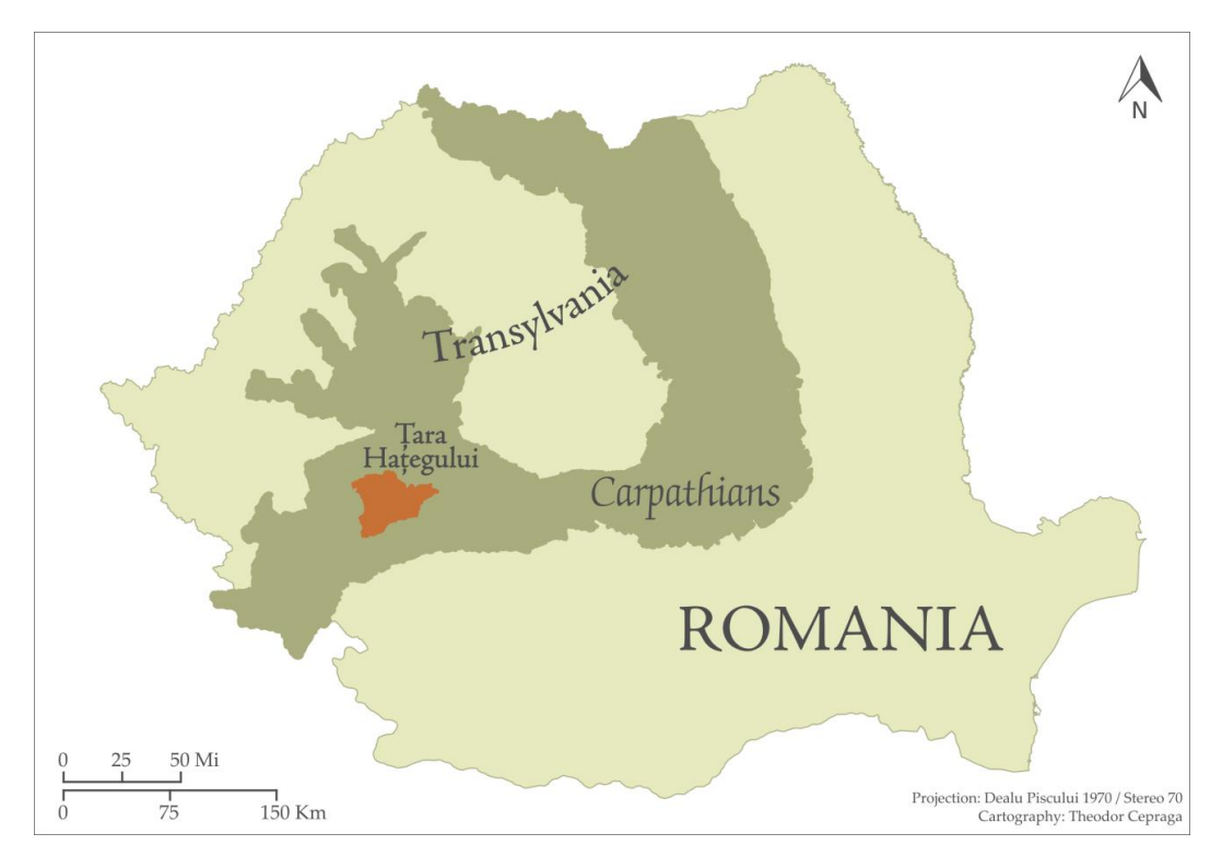
Figure 1. Location of Țara Hațegului within Romania

The study area is located in the south-western part of Transylvania, overlapping the second largest depression from the Romanian Carpathians, called the Hateg Depression (Figure 1). In the geographical, historical and ethnographical literature this area bears the name of Tara Hategului (Popa 1999; Popa 1988; Vuia 1926). All the regions from Romania which are denominated with the word tară raise difficulties in establishing their boundaries. The word has several meanings in the Romanian language. It may refer to the country, as a whole, but more often to some regions located in the Carpathian depressions (Oancea 1979) Ion Conea (1963) argued that the word tară was used to indicate the agrarian regions of the whole country as opposed to the mountains. The word also appears in many historical documents where it has the meaning of political structure ruled by local nobleman (Oancea 1979). Therefore, Tara Hategului comprises both the lowland region of the depression used for agriculture and the surrounding mountains which are playing a vital role in its local economy (Vuia 1926). The limit proposed by Nicolae Popa (1999) for Tara Hategului takes into account all the meanings of the word tară and establishes a boundary defined by 11 administrative units. Our research is based on the 80 settlements located within this area.