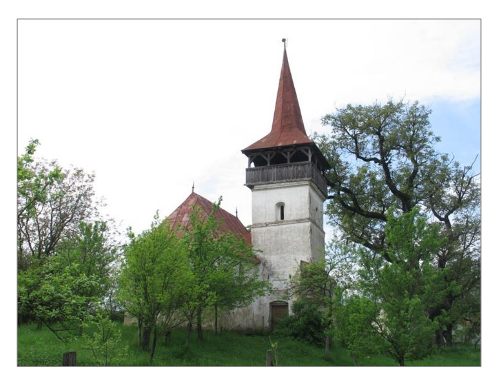
Figure 5. The protestant church from Peşteana (Cepraga, May 2014)

The beginning of the 18th century coincides with the creation of the Greek-Catholic Church in Transylvania. This institution was formed in order to represent both the interests of the Habsburg monarchy, which supported the catholic population, and the interests of the Romanians who were devoted to the Orthodox Church. Throughout the next two centuries, vicars and bishops of the Greek-Catholic Church surveyed Țara Hațegului in order to investigate the state of conservation of the churches and the existence of parochial houses and schools (Vulea 2009).