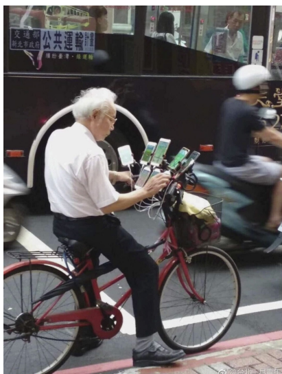
Ill. 3: Pokémania, Photo: https://www.facebook.com/MuseumOfInternet/photos/

to Zygmunt Bauman, »every human being is a wandering hyperlink«. 8 The digital map co-writes, tabulates, and increasingly removes the blank spaces of our »private life«. The everyday negotiations of our lives are cartographed by a succession of new digital techniques and applications. With the smartphone, if not before, »communication ›coincides‹ with control«. 9