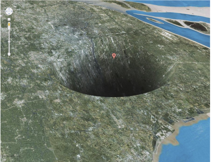
Ill. 1: Google's ubiquitous Maps as a current example, Photo: https://www.facebook.com/MuseumOfInternet/photos/

poration Google (Ill. 1). This poses a question: How are power relationships expressed in the cartographic praxis and representation of Google Maps—specifically, in terms of the previously mentioned strategies of simplifying, centralizing and hierarchizing? The advent of Google's Geo Tools began in 2005 with Maps and Earth, followed by Street View in 2007. They have since become enormously more technologically advanced.