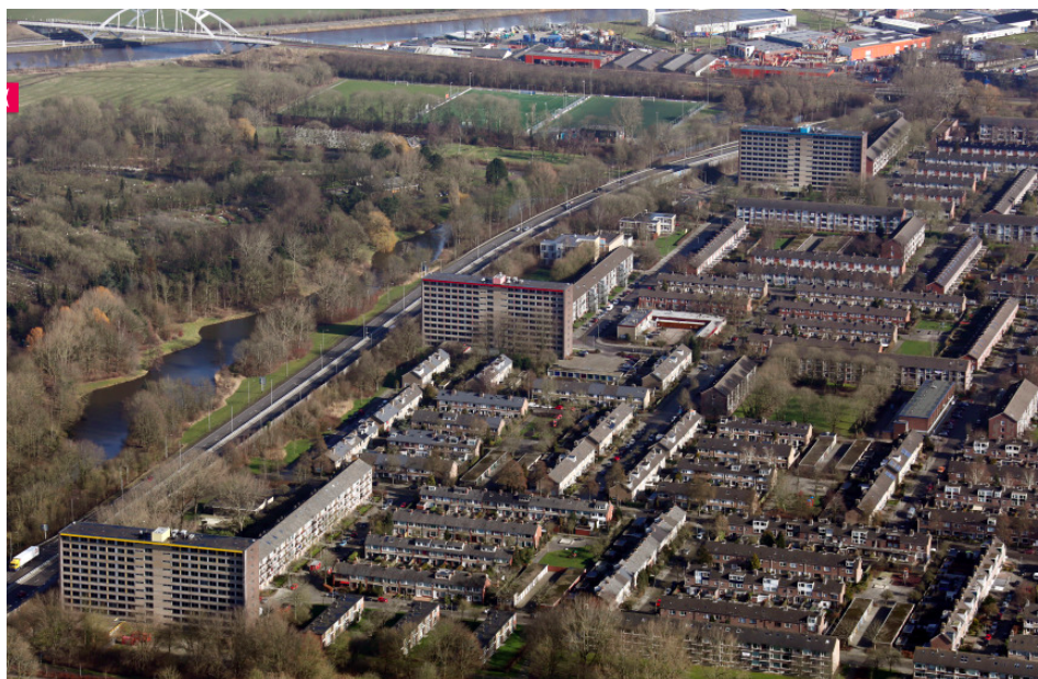
Figure 3. Selwerd seen from above, with three student flats located on the left.

In 2013, a neighbourhood renewal programme commenced in Selwerd and the student lock was abolished in 2015.