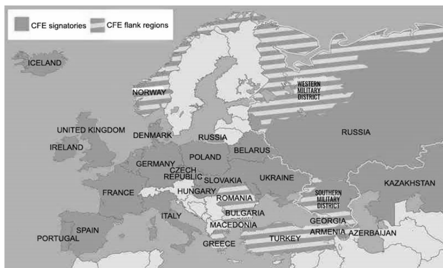
Fig. 1. CFE territory in 2003 [17]

natories to the CFE. Russia made an official proposal to the Baltics that the four countries should assume mutual responsibility for 'containing' their armed forces and preventing a disproportional increase in their combat potentials. This proposal was not accepted [16].