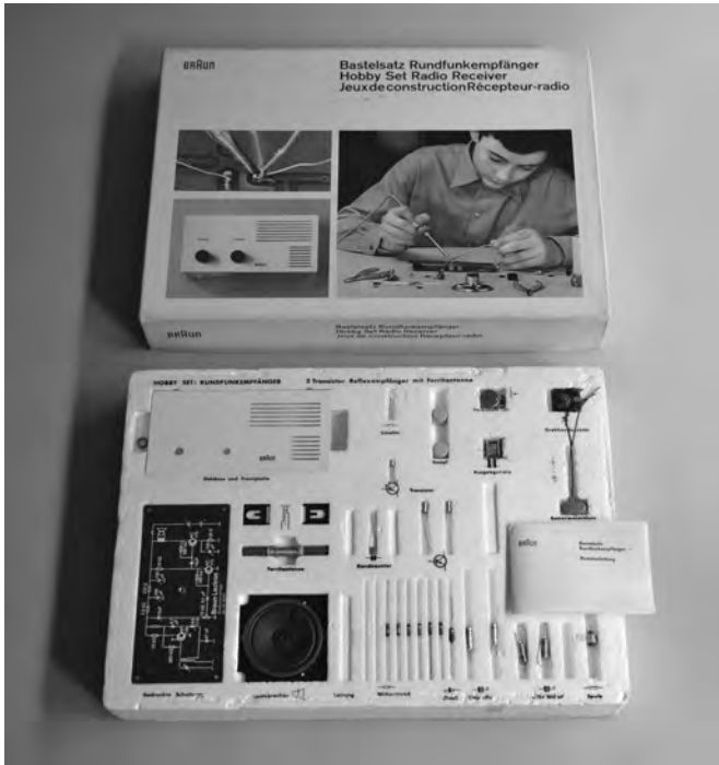
[Figure 2.1] The Hobby Set Radio Receiver design by Dieter Rams and Jürgen Greubel, 1967.

the technically interested and capable teenager. Contemporary flat design, on the other hand, incorporates design elements for a much younger age group. Its colorful surfaces, big typography, and animated characters are generally design elements used for targeting children aged two to seven—a time during which children are in the sensorimotor stage. Children in this stage, as the child psychologist Jean Piaget has shown, assign active roles to things in their environment (animism), while their activities are mainly categorized by symbolic play and manipulating symbols. It is a stage in