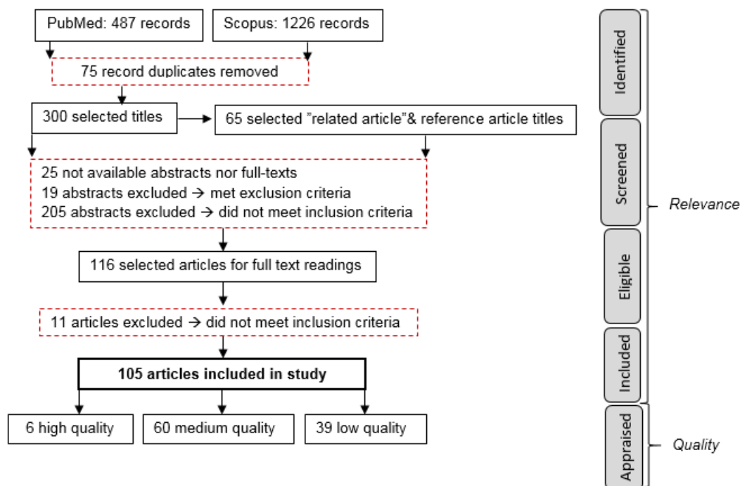
Figure 2. Study flow from identification through screening of relevance and quality.

Of the studies included, three constituted systematic reviews about blast injuries and safety issues, and three articles were cross-sectional studies (i.e., six high-quality studies). Fourteen of the reviewed articles were retrospective case series/comparative case studies and 46 were case studies (i.e., 60 medium-quality studies). Fifteen non-systematic reviews and guidelines, ten special reports, two consensus statements, and 12 perspective articles were identified in the lower part of the evidence hierarchy model (i.e., 39 low-quality studies). Table 2 summarizes the findings of the review regarding the management issues described in the articles, sorted according to MIMMS main management tasks.