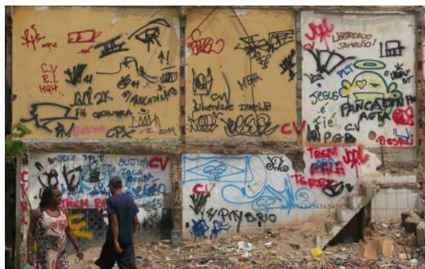
Figure 4. CV tags on home exteriors, Manguinhos, 2015.

Even before the favela’s takeover by the UPP, a large-scale urbanization project was well underway to redevelop the area that surrounds Manguinhos leading up to the Maracanã Sports Stadium. Funded by PAC, the urbanization project began in 2008 and is coordinated by the State Ministry of Works (Seobras), in partnership with Emop. According to the State Department of Finance, the total PAC investment between 2008 and 2010 was around R$ 3.1 billion (US$ 1.6 billion). Among the works delivered in 2009 was a 35,500 square meter Civic Center located on the grounds of a new mid-rise housing complex built on the grounds of the old Army Supply Depot (DSUP). The Center included a library (with a theater and cinema), a recycling facility, an ‘income generation center’, a health clinic, a women’s social service center, a legal aid center, a sports court, and a high school attached to a swimming pool known as the ‘Manguinhos Water Park’ [136].