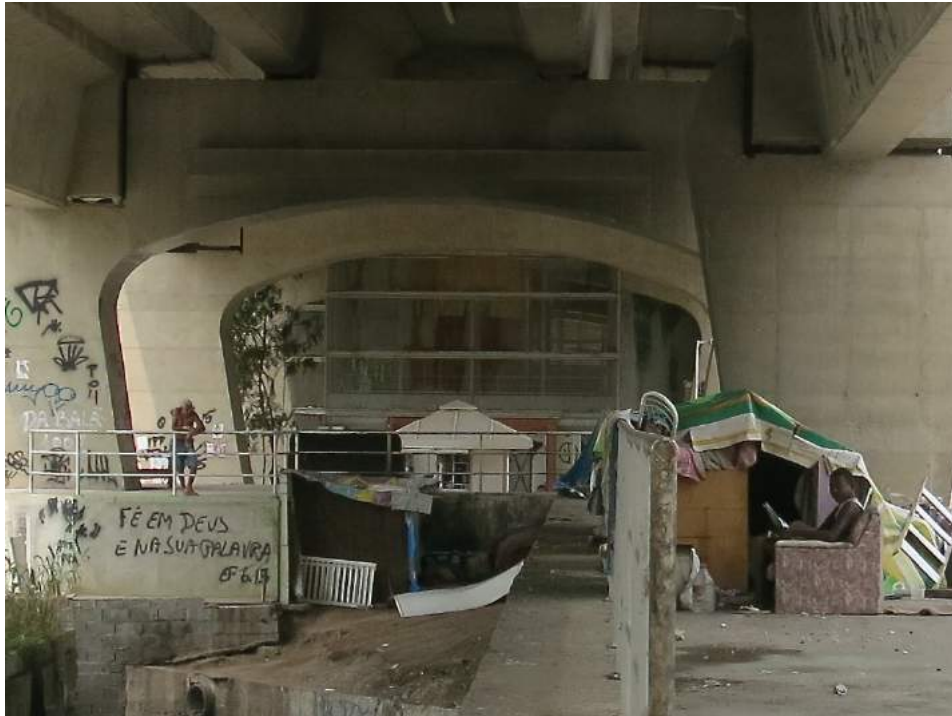
Figure 6. Manguinhos train station under the elevated tracks with river channel/open sewer, 2015.