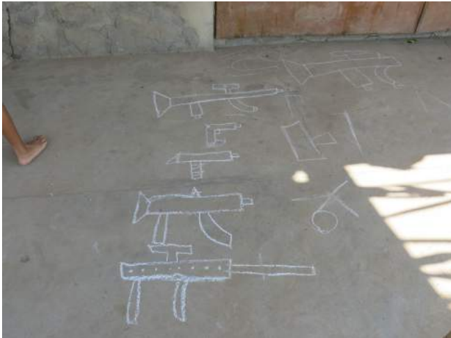
Figure 8. Children's chalk drawings, Manguinhos, 2014.