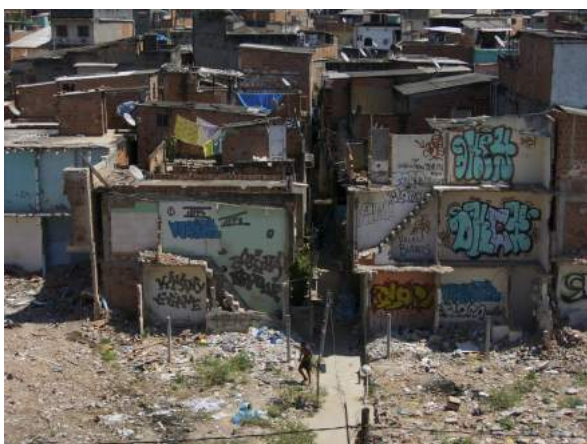
Figure 3. Partially demolished housing, Manguinhos favela, 2015.

Together, pacification and urbanization have led to a substantial rise in the real estate and rental markets in and around favelas. The perceived reduction in crime associated with the presence of the UPP also drives up the price of real estate both inside the favelas, and in the surrounding asfalto neighborhoods. This real estate spike has led to an overall increase of approximately 15% across the formal city as a whole between 2008–2011 [19]. In favelas, the jump has been as high as 300% [88].