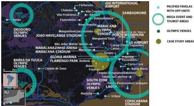
Figure 1. Map of pacified favelas in relation to Olympic venues and tourist areas.

How this framework advances on the ground, how it relates to crafting Rio as a mega-events city, and how this results in a culture of accumulation by dispossession is what this paper explores below.