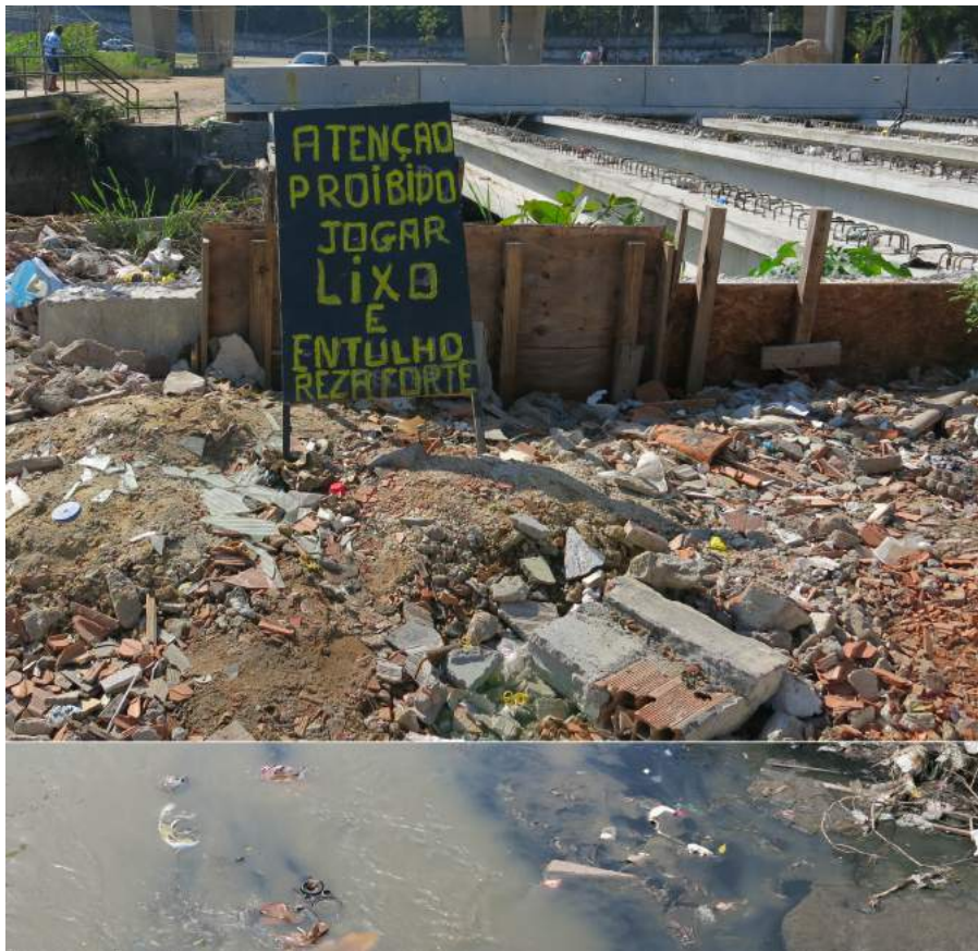
Figure 7. Stalled sewerage project and water of the Faria-Timbó River, 2015.