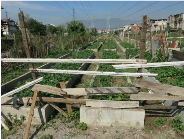
Figure 5. Hortas Cariocas organic food garden in Manguinhos, 2015.

Residents facing removal must accept minimal compensation to abandon their homes and relocate further out to the periphery of the city or resettle in the same area at far greater cost in the PAC social housing schemes. PAC has invested R$ 567 million (US$ 183 million) in building three new PPP social housing complexes in Manguinhos [150]. These complexes are essentially vertical, mid-rise favelas beset with infrastructure problems. Not only have the people of Manguinhos been denied any participation in the planning of the redevelopments, but attempts by residents to formally organize and insert their voices into the process have been deemed illegal and shutdown by the city [134].