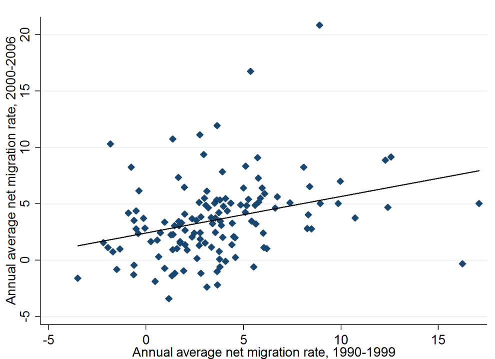
Figure 2: EU-15: Regional living standards and net migration rate 1990-2006