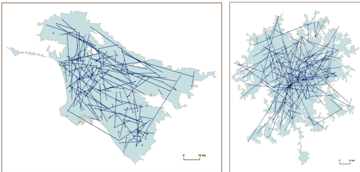
Figure 2. Los Angeles (left) and Atlanta (right) are integrated metropolitan labor markets: People live everywhere and work everywhere.

Large parts of cities need to be recycled and repaired—renovated or torn down and rebuilt anew—