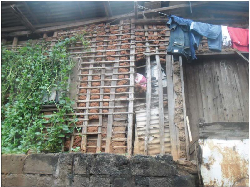
Figure 4. Apartments for Single or Group Rentals

“Petits Salons,” rented by migrants from the same village, in which they lived according to family relationships. The food was usually prepared by a woman from the village. The living conditions were the same as those observed in the Grand Salon – namely, the smallness of the house in relation to the number of people who occupied it. When a migrant wanted to bring his wife, he left the Grand or Petit Salon to rent a single room for the duration of the wife’s stay. Even in the case of an individual lease, minimising expenses was valued. Most rented apartments do not have a kitchen, annex, or living room. To cook, women use an oil stove that they place on a shelf in a corner of the room, separated from the bed by a small curtain. The room therefore serves as a place to sleep, to cook, and to receive friends and relatives.