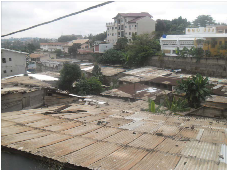
Figure 2. View of Residential Bastos on the Hill and Bastos-Nylon at the Bottom

starting credo. As a matter of fact, most of the Montagnard migrants live in the Bastos-Nylon neighbourhood, one of the marshy environments of Yaoundé. If there is an area where people live below the poverty line, and which can be presented as the emblem of insolvency, it is naturally Bastos-Nylon. Besides, it is named as such to distinguish it from the residential Bastos, which hosts distinguished residential houses and foreign embassies, and to echo the neighbourhood Nylon, known to be the most polluted neighbourhood of Douala.