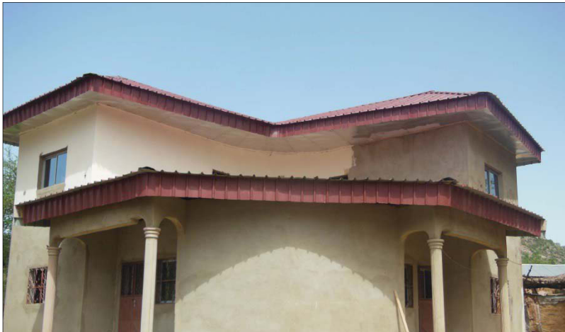
Figure 6. Build, Transform, and Destroy to Stay Competitive

The use of blocks in the buildings becomes another element of prestige. However, in this particular case, the house is no longer plastered and painted, because that would prevent passers-by from determining the building material: the block. In fact, block represents the most important material for attracting admiration and recognition from others. Its use is an act of social presence in the community, “for passers-by will say: here is the house of this or that person!” 21 Once built and even if uninhabited, the cement block house acquires the strength of personification because “speaking of the house is talking about the owner even if he is not present.” The result is the gradual transformation of the original houses to the extent that everybody – men, women, young people, old people – builds, transforms, destroys, and rebuilds, which continually reinvents the image of the village as the years go by. Moreover, the purpose of the rural–urban mobility is not only to construct a house, but also to transform it, the only means of preserving and valuing honour. Without this, the individual risks social isolation.