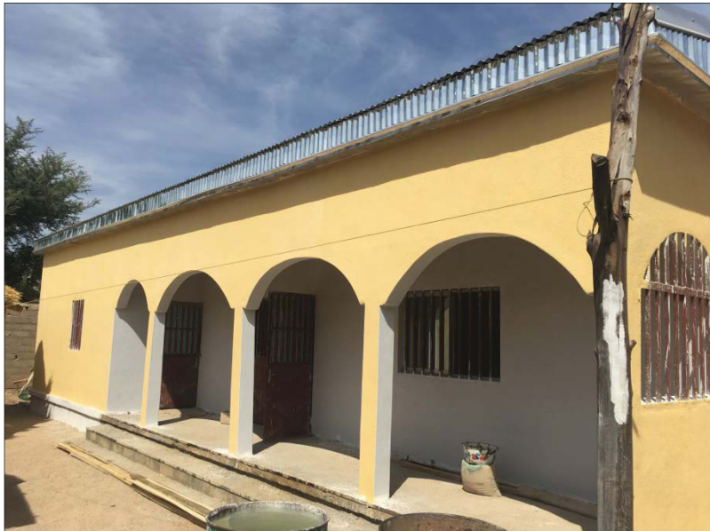
Figure 5. Rectangular and Corrugated Iron Sheet House, Material Representation of Post-Migration Success

The definition of waste as specified above provides the people of the village with an arena to criticise the choice of some of the migrants to build houses in the city because “one is never at home when elsewhere.” 20 In other words, to build beautiful houses outside the village is to give them more value than they need, and therefore it is wasteful. On the other hand, a rectangular house roofed with a corrugated iron sheet built in the village will always be a source of honour and respectability for the individual. By absorbing the labour force deployed during migratory exile, the house acts as a sign of identity and power necessary for the social ascension of the individual and the redefinition of his power relations within the village. This concern for honour and respectability consumes the energy of the migrants, so much so that they in some ways compete for the most beautiful and largest house in the village.