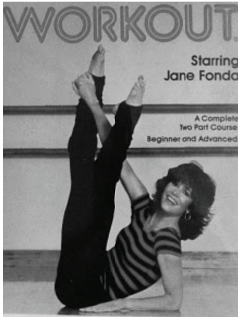
Figure 2: Cover of Fonda's First Aerobics Video