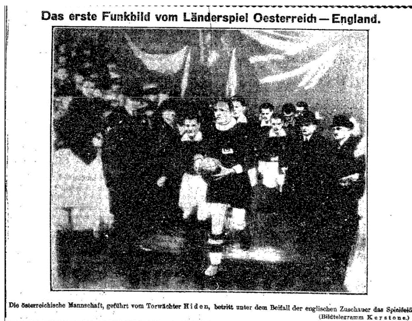
Figure 5: The First Wirephoto of the International Game Austria–England