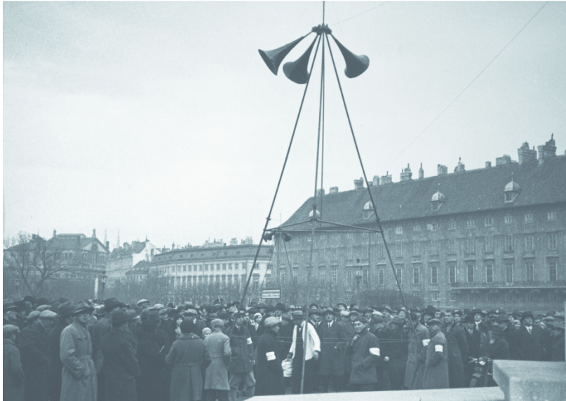
Figure 2: People at Vienna's Heldenplatz, Listening to the Live Radio Broadcast of the Match.