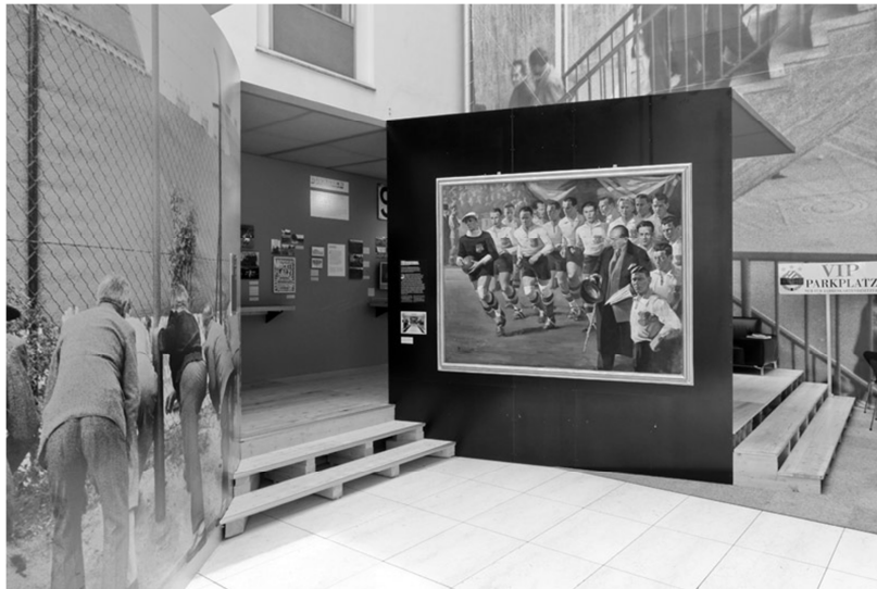
Figure 7: The Wunderteam Painting as Part of the Exhibition "Wo die Wuchtel fliegt. Legendäre Orte des Wiener Fußballs" (Legendary places of Viennese football)

history. The painting is regarded as an example for nation-building with the help of the image of a popular football team: an object that offers insights into a defining moment of Austrian history.