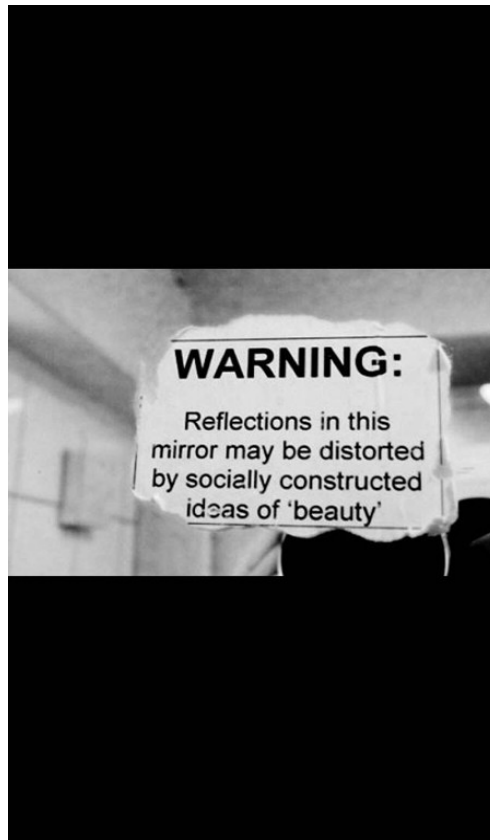
Figure 5: A trigger for thoughts on self-image. Photo taken by a female co-researcher (age 17 years) in the Youth's Voices study.

Interviewer: "And would you change anything about it?"