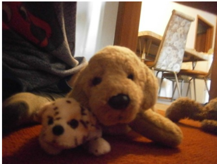
Figure 2: Stuffies. Photo taken by a male co-researcher (age 12 years) in the Living with and Managing Hemophilia and other Bleeding Disorders study.[8]