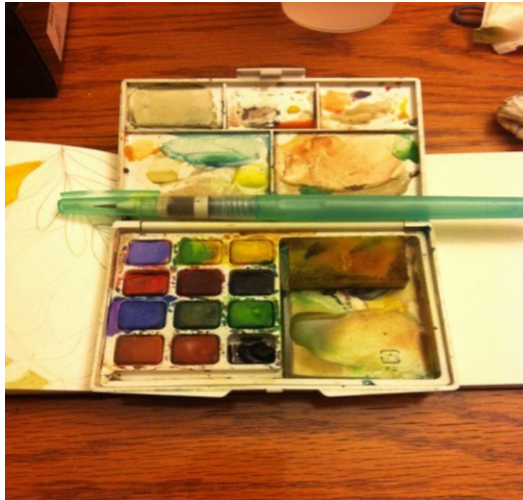
Figure 1: I am more than my chronic illness. Photo taken by a female co-researcher (age 26 years) in the Living with and Managing Hemophilia and other Bleeding Disorders study.

"There's more to a person than just their disease, there are passions that you don't see when I'm at worst in the emergency department. Um you know you, obviously you see the worst, you don't see the best, and this is, this is my best, this is my, this is my confidence, this is what I'm confident in, this is what I excel in, this is my happy place. So no one, no one sees that when I'm really sick and that makes me sad because as an artist and as an illustrator you want to share that, you want to show everyone" (Female co-researcher, age 26 years, from the Living with and Managing Hemophilia and other Bleeding Disorders study). [6]