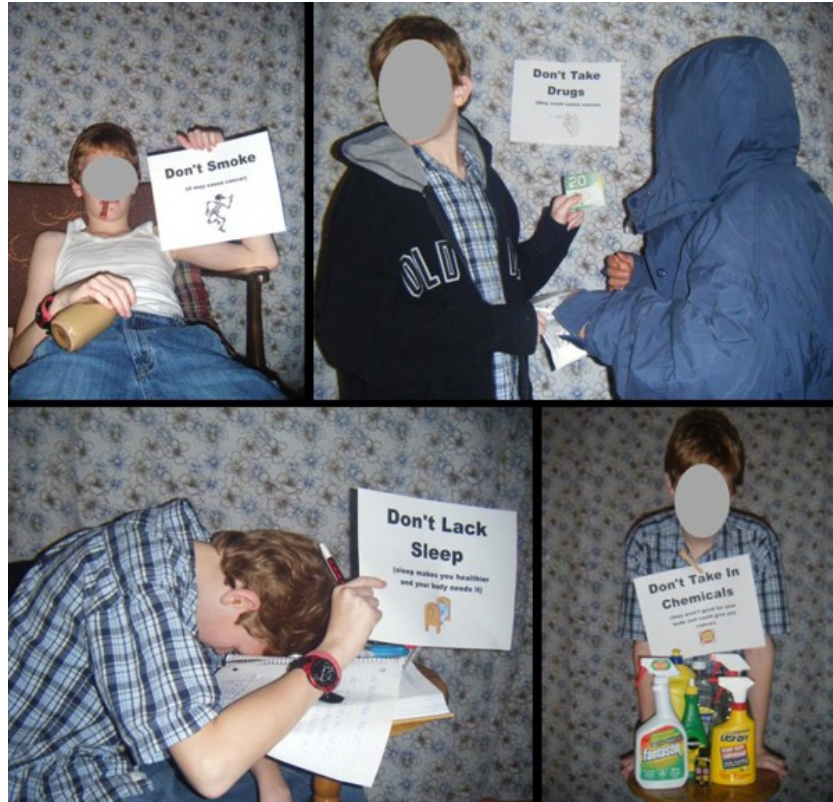
Figure 4: Staged scenes. Four examples of photos taken by a female co-researcher (age 12 years) from the Adolescent Cancer Prevention study. [19]

inspiration or different realities that they had hoped for. On a few occasions IN•GAUGE® co-researchers took the liberty of staging scenes towards theatrically constructing their photographs. For example, a co-researcher from the Adolescent Cancer Prevention study involved her family members in creating scenes that reflected her concerns with cancer and cancer prevention (Figure 4).