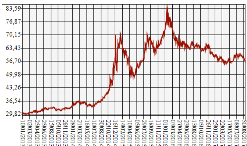
Fig. 2. The value of the Russian Rouble against the US dollar since the beginning of 2013 3