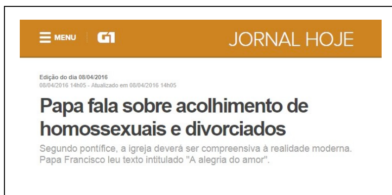
Figure 4. Article from Jornal Hoje website - Rede Globo - Brazil

This bundle of relationships is evident in the images circulating on the Pope's profile on Instagram and Facebook. Rosa (2015) speaks of images as a symbol of an event. In this case, we observe Pope Francis' gestures transformed into an event from its inscription in several media, representing its value in circulation. In most cases, the sentences or situations are pinched and passed on, valued by both social actors and journalistic institutions. Thus Rosa (2015) points out that when an image becomes a symbol of an event, 'bigger is its value of circulation on devices of media institutions and on media devices of individual actors is increased, enlarging its power of transcendence' (Rosa, 2015, p. 139).