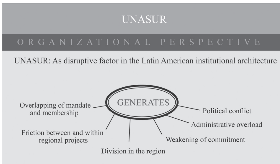
Figure 1: UNASUR – Organisational perspective

As to the Latin American spaghetti bowl, both the proliferation and the overlapping of regional organisations, as well the possible consequences thereof, have been broadly discussed. One group of analysts – best represented by Malamud and Gardini (2012) – take a very critical view of this. They state that ‘the presence of segmented and overlapping regionalist projects is not a manifestation of successful integration but, on the contrary, signals the exhaustion of its potential’ (Malamud and Gardini 2012: 117). In their opinion, the multiple memberships of states in different (sub)regional organisations will invariably create friction between and within regional integration projects – and thus will ultimately fuel division instead of unity in the region. Moreover, as Gómez-Mera (2015: 20) indicates, ‘by introducing legal fragmentation and rule ambiguity, regime complexity has exacerbated implementation and compliance problems in Latin American regional cooperation initiatives.’