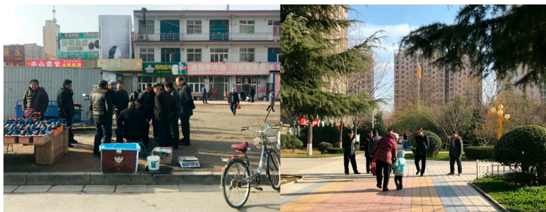
Figure 2. Older people’s self-created space and government-financed “free” amenities.

“I often play [Chinese chess] on the street and eat at home. The aim of our generation is to earn more money for our children’s education. Low education means you [younger people] have to do heavy and dirty labor works.”