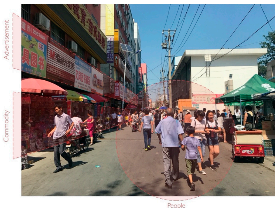
Figure 1. Age-related spatial segregation for LUM-education: children behaviors, demands and supplies of shops, and advertisements.

As reported by the interviewees, most parents have to work during the day, so taking care of children becomes a commercial opportunity. This results in many and varied educational amenities (e.g., after-school homework tutoring, and the teaching of special skills, such as dance and drawing), as well as other amenities for children (e.g., selling toys, stationery, special snacks, and sweet drinks) emerging around schools. Considering the features related to children (e.g., safety issues and limited walking territory), these amenities need to be as close to schools as possible [34,43]. Their type and opening times relate to schools' agendas and aim to meet children's demands in various ways, instead of satisfying adults' everyday demands (Figure 1). The neighborhood environment is significantly transformed by the schools' affiliations over time into a specific type of neighborhood, geared specially for the after-school market and of little value to anyone else. As older adults are more sensitive and likely to be affected by the neighborhood environment [40–42], the educational amenities, therefore, negatively impact on walking duration of middle-aged adults in our study.