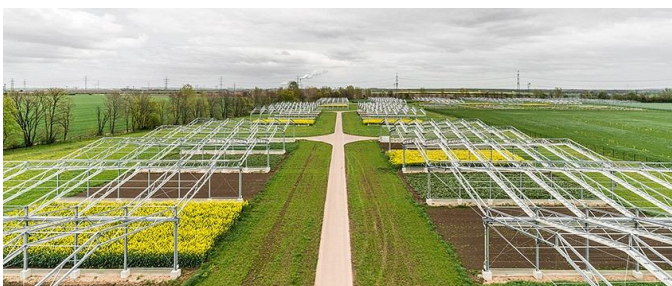
Figure 4. Global Change Experiment Facility.

Another long-term experiment at GCEF started in 2014 to investigate the effects of future climatic conditions on ecosystem processes under five different land-use scenarios. The facility simulates higher temperatures and altered precipitation patterns in Central Germany with reduced rainfall rates by 15% in summer and increased precipitation in winter and spring by 5% (Schädler et. al. 2019).