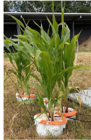
Figure 5. Integrated total nitrogen input system with corn growing in 2019, Photo: Ina Krahl

realized. The following land use systems will be implemented: conventional farming, organic farming, intensively used meadow, extensively used meadow and extensively used pasture (sheep grazing) (Schädler et.al. 2019).