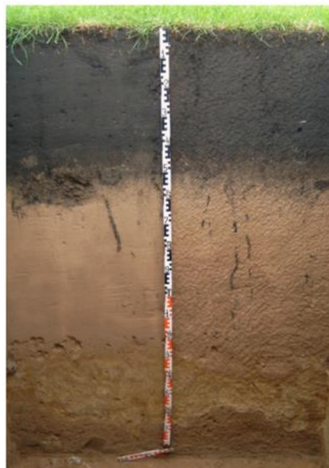
Figure 1. Chernozem profile in Bad Lauchstädt.

The climate conditions are characterized by a mean annual temperature of 8.7°C and mean annual precipitation of 484 mm (mean of years 1896-2004) (Merbach and Schulz 2012). Figure 2 provides an overview of precipitation and temperature since the beginning of the long-term field experiments in 1895. As can be seen, the temperature shows an increasing trend whereas in case of precipitation a high variation year by year by low mean level is a specific feature of the site. In addition, we were informed about very low annual precipitation in 2018 with 250 mm and a deficit in precipitation in the current year.